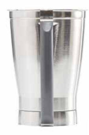
Stainless steel bowl and blade