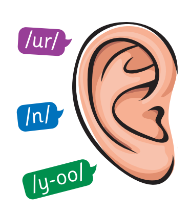
listen to the phonemes