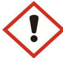
Materials Causing Other Toxic Effects