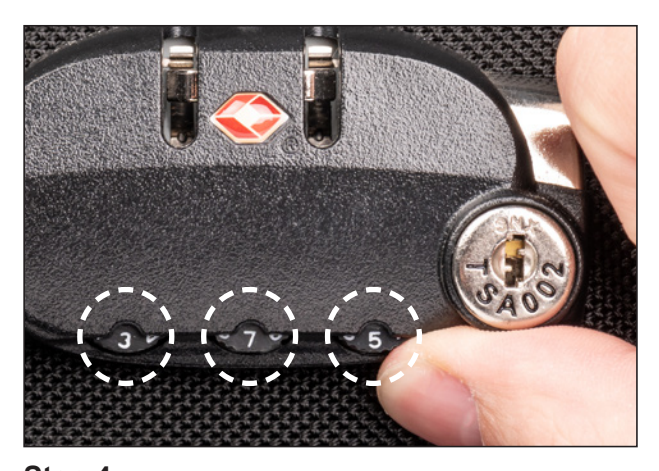
Step 4: SET the numbers to your desired combination. Please REMEMBER your new combination!

The lock's combination is pre set from the factory at 0 0 0. To CHANGE the combination , there is a hole on the side of the lock. Push the button IN with a pen until you hear a 'click'.