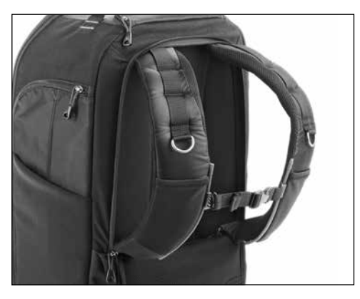
Step 4: Untuck the backpack straps from the pocket and adjust as needed for proper fit. Reinsert the backpack straps into the pocket to use the backpack as a rolling bag.