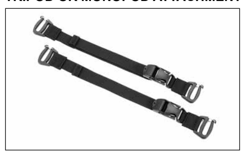
Step 1: Locate the two adjustable tripod straps provided with the StreetWalker.