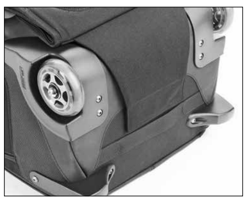
Step 3: Wrap the panel to the bottom of the bag and tightly attach the panel in place with the hook and loop.