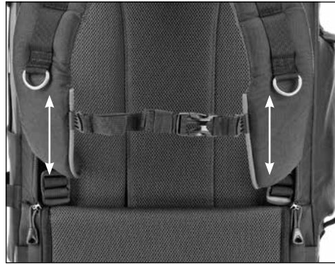
The sternum strap adjusts up and down along the blue rails on the backpack straps.