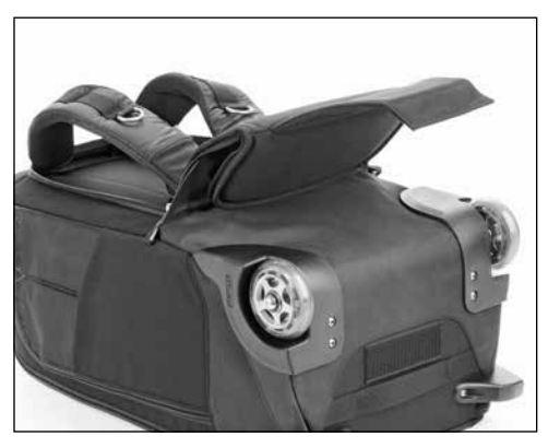
Step 2: Pull the panel down fold the top half of the zippered panel underneath to create a lumbar pad.