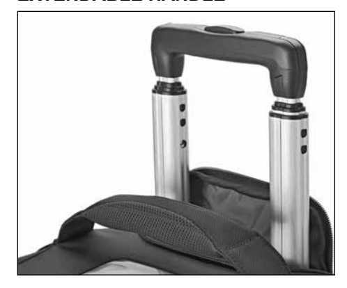
Open the zipper flap on top of the StreetWalker to reveal the extendable handle. To raise the handle, press and hold the button on the middle of the handle and simultaneously raise the handle completely. The release button must always be held down for the handle to be fully extended or retracted