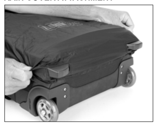
Step 1: Place front feet through holes in rain cover and pull rain cover to the top of the roller.