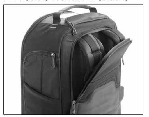
Step 1: Completely unzip the panel covering the backpack straps.