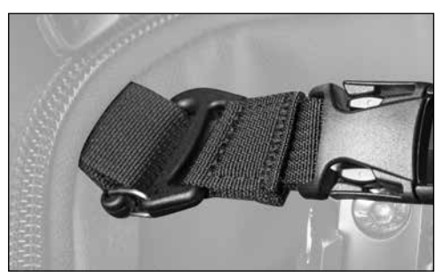
Step 3: Slide the opened Double Gatekeeper buckle through the webbing loop and close it by depressing the top plastic bar and securing the gate.