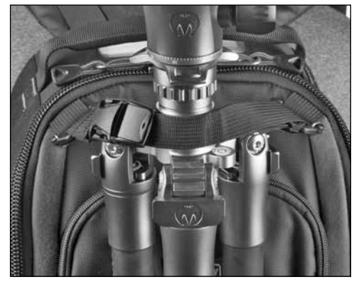
Step 2: Unlock the adjustable strap, then pull the strap tight around the top of the tripod. Tighten the lower strap around the exposed leg for additional stability.