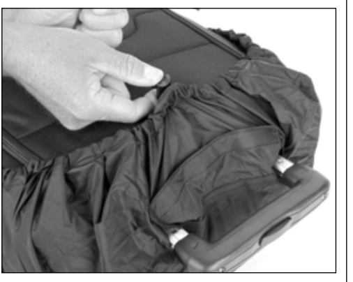
Step 3: Re-attach hook/loop panel between retractable handle tubes and tighten drawstring to secure the rain cover.