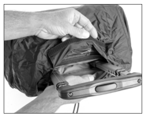
Step 2: Detach the hook/loop panel at the top of the bag. Place retractable handle through slot and tighten rain cover.