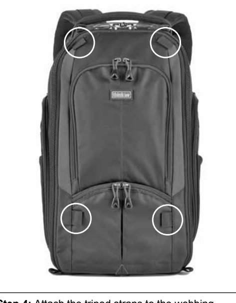
Step 4: Attach the tripod straps to the webbing loops at the top and near the bottom of the StreetWalker.