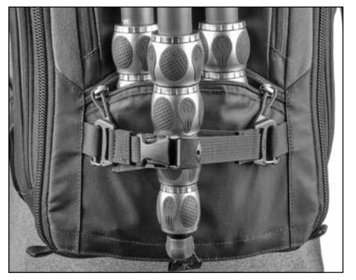
Step1: Insert two tripod legs into the outside lower pocket.