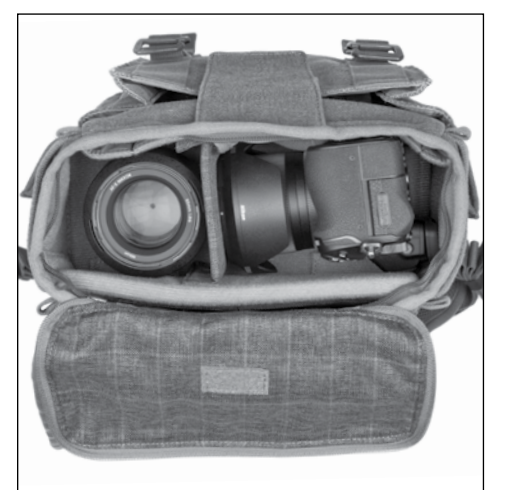
With top compartment construction, camera equipment can be easily accessed while the main compartment is used for personal items.