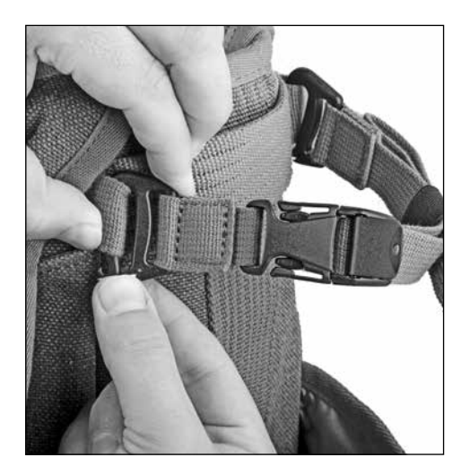
Step 2: Slide the opened Double Gate Keeper through the webbing loops on the top of the side panel and close the Double Gate Keeper by depressing the top plastic bar and securing the gate.