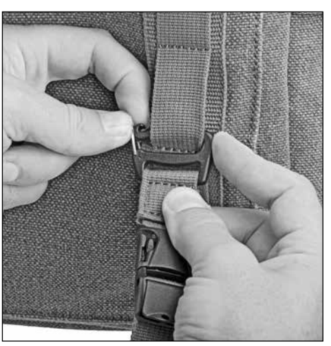
Step 2: Slide the opened double gate keeper through the webbing loop directly below the brass hook and close it by depressing the top plastic bar and securing the gate.