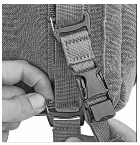
Step 3: Open the double gate keeper on the opposite side of the strap and slide it through the webbing loop at the bottom of the bag.