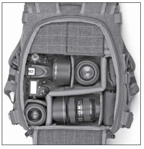
Prime Kit 2:3 Layout