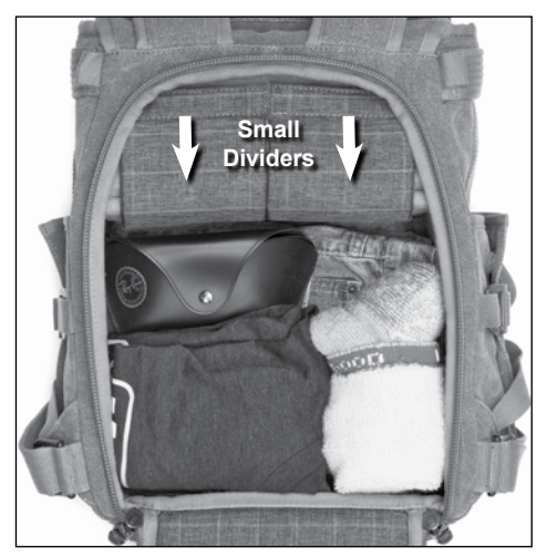
Step 3: Use "Small Dividers" to secure edge gaps.

Step 2: Place "Double Hinge Divider" underneath. Note: One hinge folds down the side.