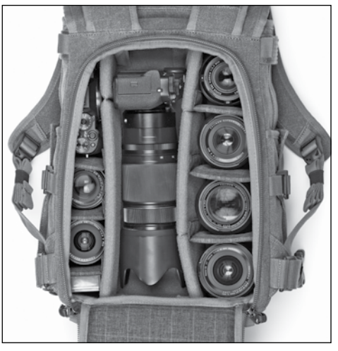
Traditional Layout: All gear with back and top access.