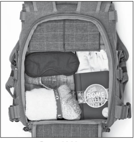
Personal 2:3 Layout