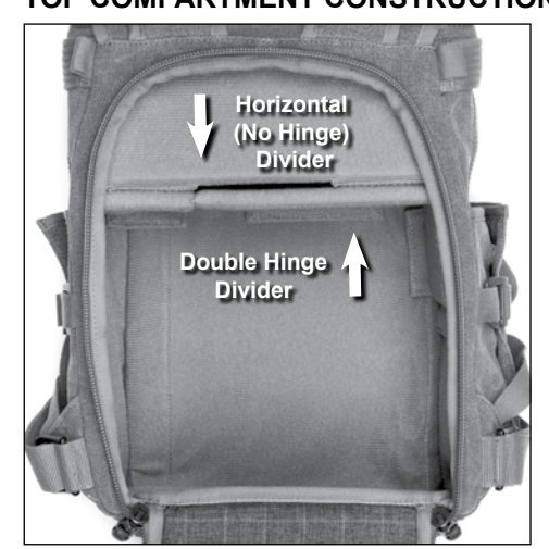
Step 1: Place "Horizontal Divider" at the top of the bag

Step 2: Place "Double Hinge Divider" underneath. Note: One hinge folds down the side.