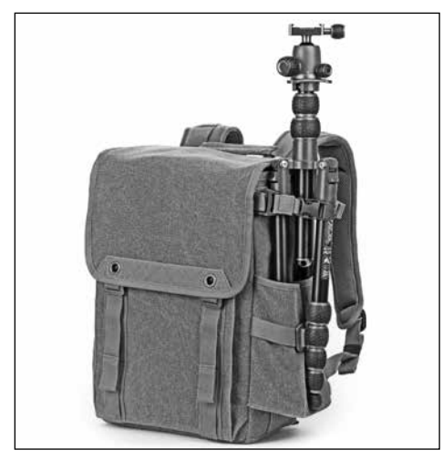
Step 3: Place 2–3 feet in the pocket and tighten strap. Secure top strap around the tripod head. If you find that the tripod moves from left to right, wrap the strap one full rotation around the tripod and then secure the strap.