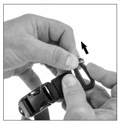
Step 1: Locate the two adjustable tripod straps provided with the Retrospective Backpack. To open the Double Gate Keeper, press the gate inwards then depress the top plastic bar in order to release the gate.