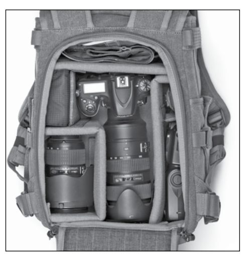
Traditional Kit 3:4 Layout