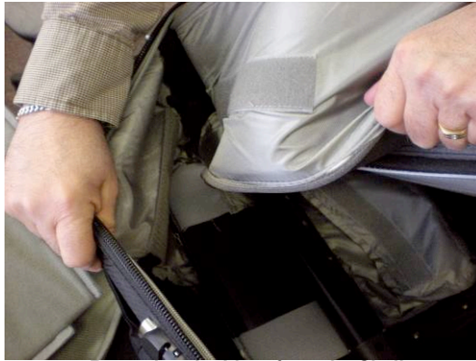
Removing the Liner from the Shell