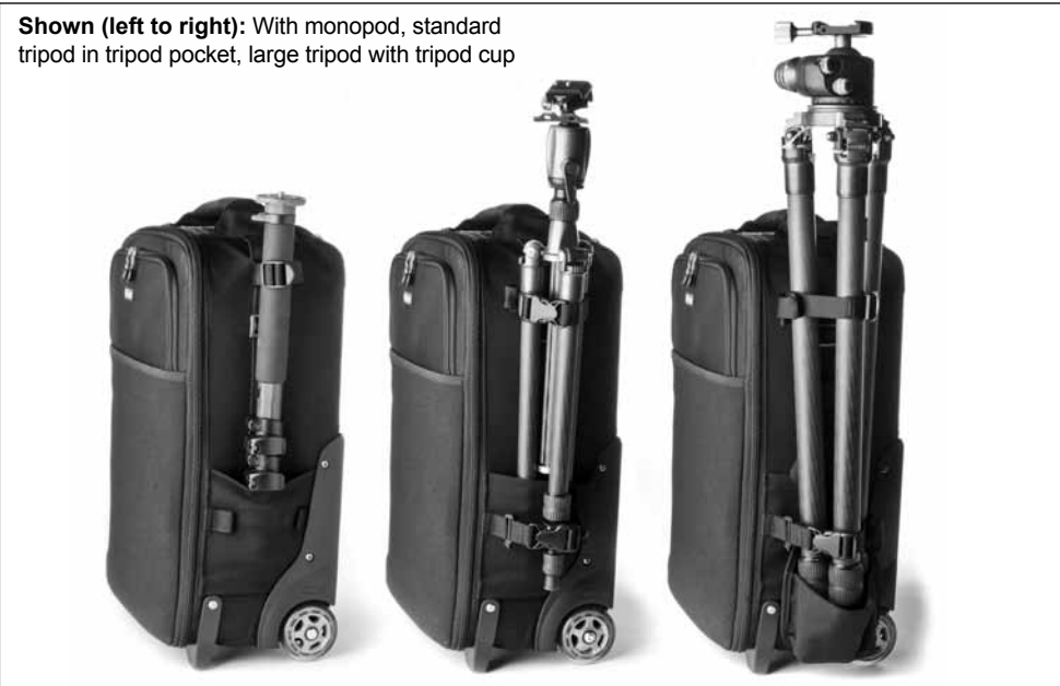
Shown (left to right): With monopod, standard tripod in tripod pocket, large tripod with tripod cup

Step 2: Place two tripod legs into the expandable pocket on the side of the bag and use the compression strap to secure the lower portion of the tripod to the side of the bag. Pull the buckle straps on both the Compression Strap and Tripod Strap to tighten the tripod onto the side of the bag.