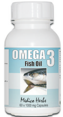
60 x 1000mg Capsules