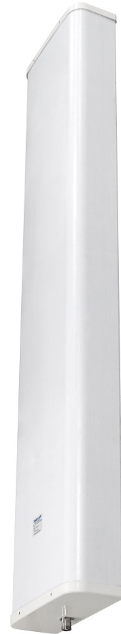
Antenna may not appear exactly as image.