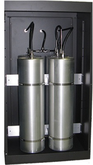
Cabinet cover removed