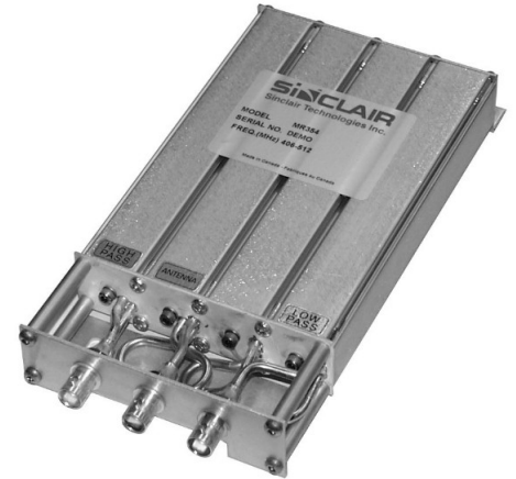
BNC connector model shown.

When ordering, please refer to the chart below for the model number, and also specify the Tx and Rx frequencies. Different connector configurations are subject to various list price. Customization is also available. Please contact your Sinclair Sales Representative or Customer Service Representative for more information.