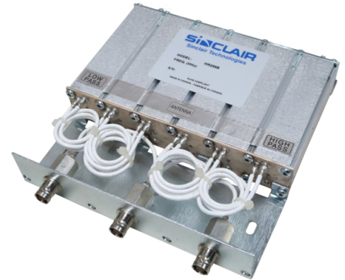
BNC connector model shown.

When ordering, please refer to the chart below for the model number, and also specify the Tx and Rx frequencies. Different connector configurations are subject to various list price. Customization is also available. Please contact your Sinclair Sales Representative or Customer Service Representative for more information.