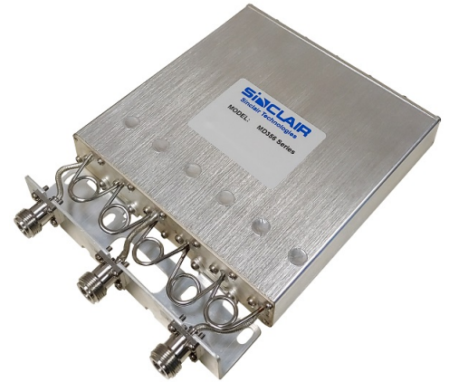
N type connector model shown.

The Tx and Rx frequency separation available is 5 or 10 MHz. See below chart for detailed ordering information, and specify Tx and Rx frequencies when ordering. Other connector types are also available, please call for details.