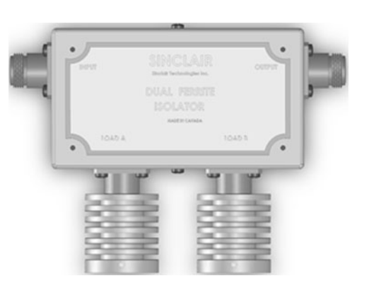
Dual 30 Watt model shown