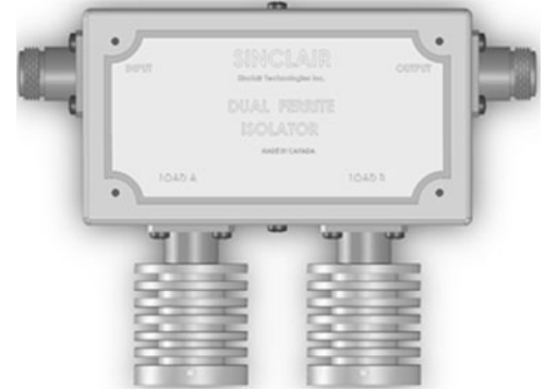
I221T dual 30 watt model shown.