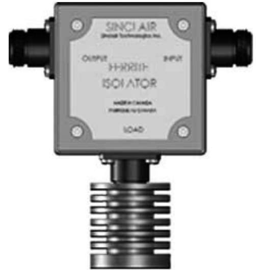
I2112T 30 watt model shown.