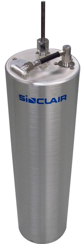
Filter may not appear exactly as picture.