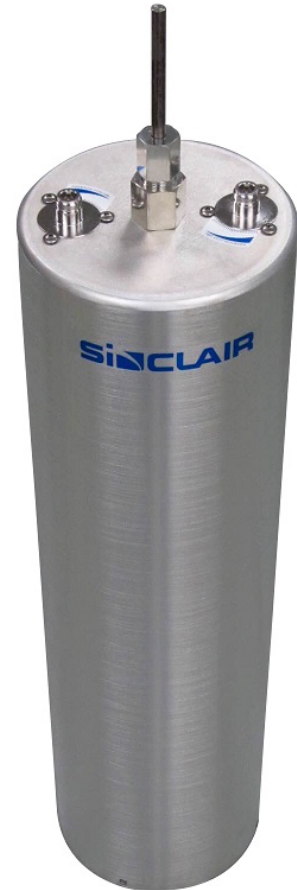
Filter may not appear exactly as picture.