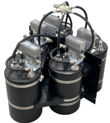
Combiner may not appear exactly as shown.

z=3 406-440 MHz z=4 430-470 MHz z=5 459-512 MHz z=6 380-400 MHz