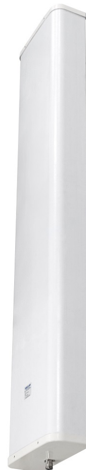
Antenna may not appear exactly as picture