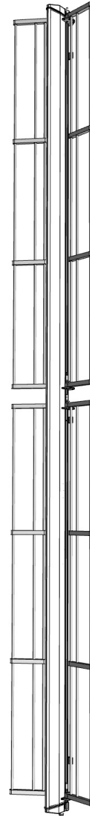
Antenna may not appear exactly as shown in image