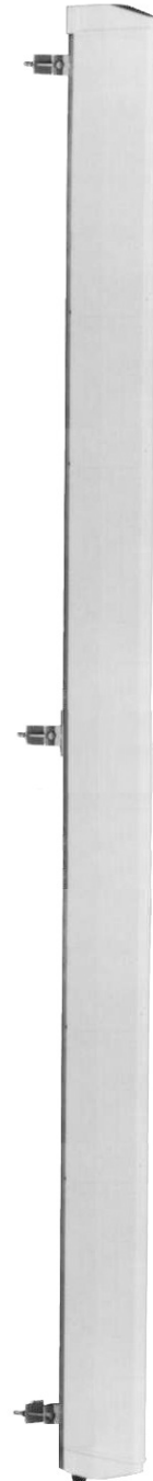
Antenna may not appear exactly as shown in image