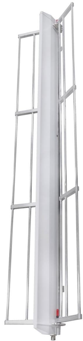
Antenna may not appear exactly as shown in image