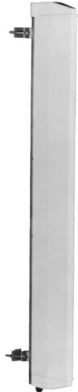
Antenna may not appear exactly as shown in image