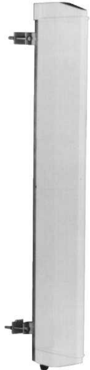
Antenna may not appear exactly as shown in image