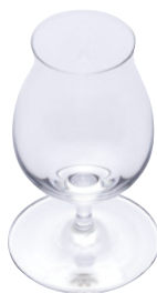
Glass Type A