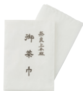
Chakin (Tea cloth)