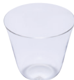
Glass Type T