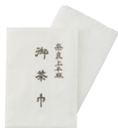
Chakin (Tea cloth)