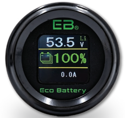
CAN LCD METER

If a trouble code appears on your meter, please record the trouble code and contact your dealer to discuss the code and, if necessary, take any actions required to correct it.