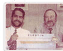
Press conference at the launching of the first Eleotin