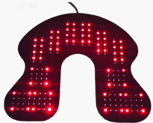
HealthLight Knee and Shoulder Pad

In terms of its therapeutic capacity, it elicits 152.3 joules per minute of infrared therapy and also features 72 red diodes and 132 infrared diodes. It provides two options for color, including red and infrared.