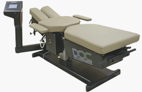
DOC Decompression Table

The DOC Decompression Table features a traction belting system, allowing for optimal decompression throughout treatment. In addition, its user-defined relax and hold times and adjustable speed settings allow for individualized therapy. It is also equipped with pre-programmed decompression protocols for ease of use for both lumbar and cervical decompression. Additionally, its real-time digital tracking offers a constant log of therapy progress, assisting chiropractors in their practice.