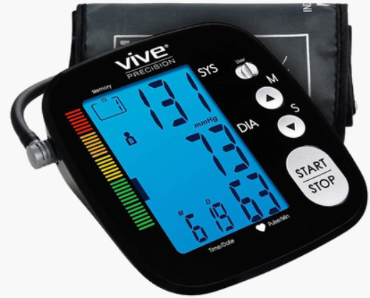
Blood Pressure Monitor

Blood pressure monitors are a great medium for convenient and easy tracking of blood pressures, which can provide insight into patient care. This blood pressure monitor features a user-friendly design that can monitor as many as two users at once. It takes accurate measurements while storing previous readings for optimal monitoring.