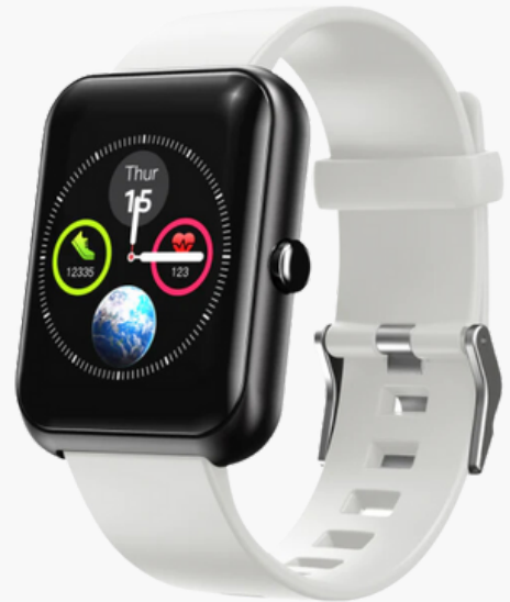
Fitness Tracker Model: V

This fitness watch is convenient and durable for patients, featuring a water-resistant design, a sleek black or gray wristband, long battery life, and a complementary magnetic USB charger.