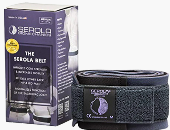
Serola Sacroiliac Belt

The Serola Sacroiliac Belt specifically includes hook-and-loop straps that secure the belt to the waist. With patients wearing this belt frequently, Serola prioritizes durability, ensuring that it can withstand general wear and tear over time. In addition, it possesses moisture-wicking webbing, making it breathable, dry, and comfortable. Available in four sizes, the Serola belt can be used for patients of all shapes and sizes.