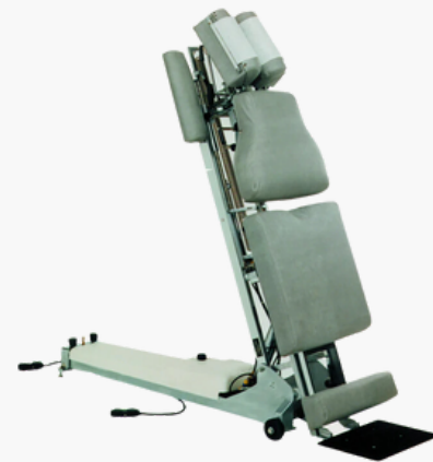
Lloyd Galaxy Hylo

Not only is the table effective and cutting-edge, but it looks nice too, equipped with durable Naugahyde upholstery and a one-piece chest cushion for further patient comfort. It also prioritizes safety with a tilt safety switch.