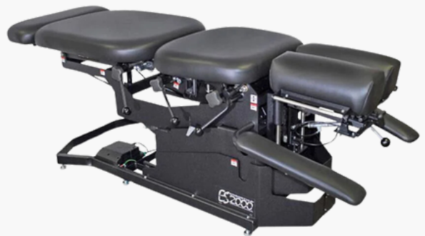
Ergostyle ES2000 Gen II Elevation Table

Patient comfort is paramount with a 22.5-inch-wide seamless cushions featuring multi-density foam and ankle rests. The ES2000 contains everything a practitioner needs down to the details, even including a paper roll cutter and holder.