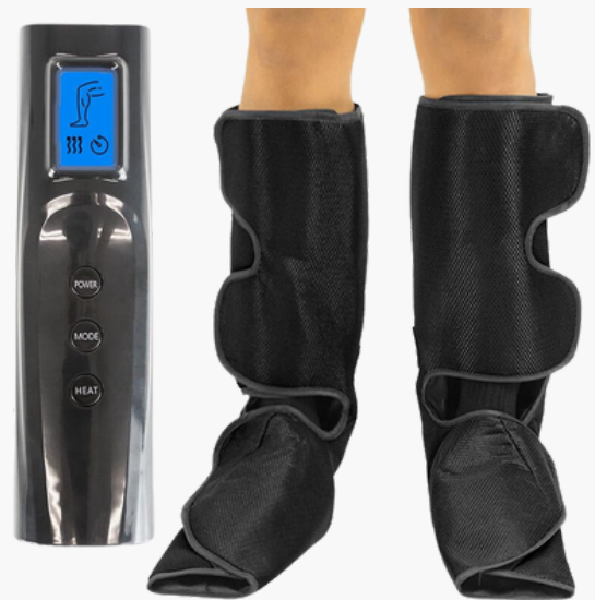
Calf and Foot Compression Massager

Though compact, the massager can fit calves up to 21 inches and feet up to 14 inches and includes two extenders. It is integrated with a control panel, where massage modes, heat, and intensity levels can be adjusted for a customizable treatment experience.