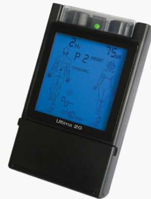
Ultima 20 TENS Unit

Therapeutically, the Ultima 20 TENS Unit delivers gentle electronic stimulation for the purposes of knee, lower back, and neck pain. Both pulse frequency and width can be adjusted, allowing for individualized and tailored treatment.