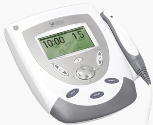
Intellect TranSport Ultrasound Machine

The Intellect TranSport Ultrasound Machine is a portable ultrasound machine that leverages ultrasound waves to stimulate the muscles, thus supporting rapid injury recovery and relieving joint pain. This device is watertight, meaning that it can be used under water. In addition, it is lightweight weighing only a couple of pounds, so it is easily portable to take wherever you need to go. The ultrasound machine also features ten memory positions, meaning providers can store and access individualized therapy settings, promoting more personalized patient care.