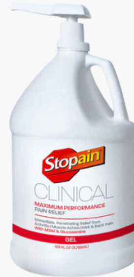
Stopain® Clinical Gel

Leveraging these therapeutic mechanisms, Stopain produces clinical gels, sprays, roll-ons, and migraine and headache solutions. Thus, Stopain provides pain relief solutions for all types of pain and client needs.