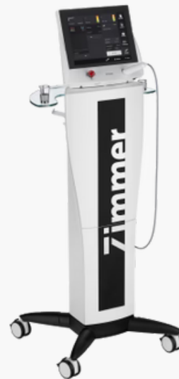
Zimmer OptonPro 25

The Zimmer OptonPro Laser Therapy System provides high-energy laser therapy, producing as much as 25 W and 810, 980, and 1064 nm wavelengths. The laser applicator is ergonomic and equipped with an adjustable switch for ease of use, coupled with exchangeable spacers for precise applicator placement.