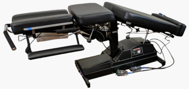
Leander 950 Series

The Leander 950 prioritizes convenience without compromising patient comfort and safety. The plug-in electrical foot switches and central caudal section mount controls provide ease of access. The break-away abdominal section is comfortable for patients, and the shut-off switch provides additional safety.