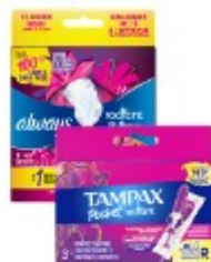
FEMININE PACKS SIZE 1 / 3 PK