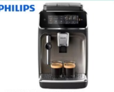
PHILIPS ESPRESSO CAPPUCCINO MACHINE EP3326/90 $799 99