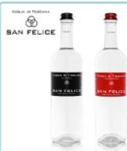
AGUA DE FUEBONA SAN FELICE MINERAL WATER NATURAL / SPARKLING 12 x 750 ml $20 99 EACH