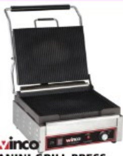
winco PANINI GRILL PRESS 14 IN