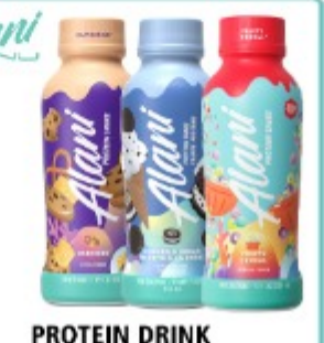
Alani PROTEIN DRINK SELECTED FLAVOURS 12 x 355 ml $27 79 EACH