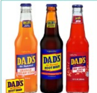
DAD'S SOFT DRINK SELECTED FLAVOURS 12 x 355 ml $13 99 EACH