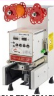
BUBBLE TEA SEALER 120 V