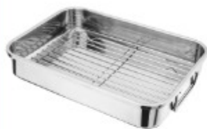
ROASTING PAN & GRILL 40 x 30 cm 1 CT