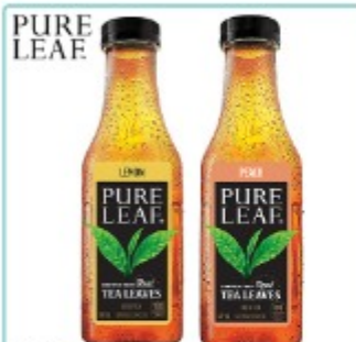
PURE LEAF ICED TEAS SELECTED FLAVOURS 12 x 547 ml $24 59 EACH