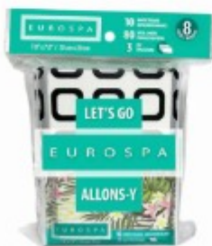
EUROSPA WALLET TISSUE 3 PLY / 8 PK