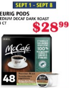
SEPT 1 - SEPT 8 KEURIG PODS MEDIUM DECAF DARK ROAST 48 CT $28 99