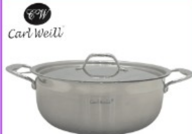
Carl Weill INDUCTION READY POT 14.8 L