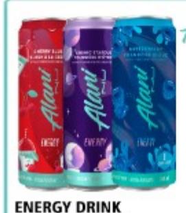
Alani ENERGY DRINK SELECTED FLAVOURS 12 x 355 ml $27 99 EACH