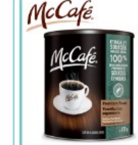
McCafe FINE GROUND COFFEE MEDIUM DARK ROAST 875 g $20 49