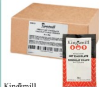
King'smill HOT CHOCOLATE POWDER 50 x 28 g $16 29