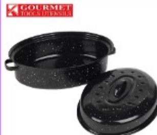
GOURMET TOURNOIRS ENAMEL ROASTING PAN 1 CT 22 lb