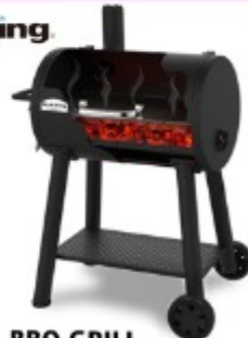
CHARCOAL BBQ GRILL 24 IN / 2 BURNER