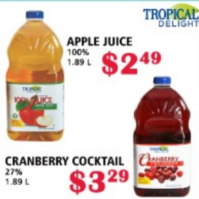
TROPICAL DELIGHT APPLE JUICE 100% 1.89 L $2 49 CRANBERRY COCKTAIL 27% 1.89 L $3 29