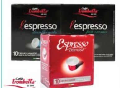
Espresso COFFEE CAPSULES SELECTED VARIETIES 10 CT $3 49 EACH