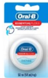
Oral-B FLOSS 1 CT