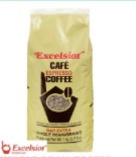
Excelsior WHOLE BEAN COFFEE 2.2 lb $11 69 EACH