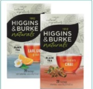
HIGGINS & BURKE TEA BAGS SELECTED FLAVOURS 20 CT $3 49 EACH