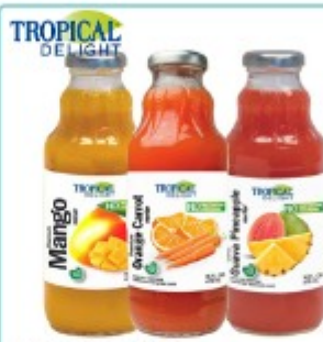
TROPICAL DELIGHT NECTAR JUICES SELECTED FLAVOURS 12 x 473 ml $15 69 EACH