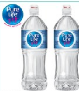
Pure Life SPRING WATER 24 x 710 ml $9 69