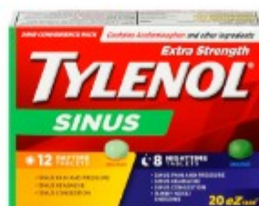
TYLENOL SINUS MEDICATION 20 CT