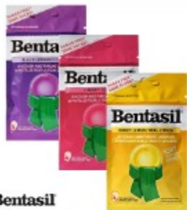
Bentasil LOZENGES SELECTED FLAVOURS 38 g