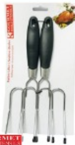
GOURMET TOURNOIRS TURKEY LIFTER STAINLESS STEEL 1 CT