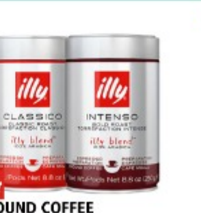
illy GROUND COFFEE SELECTED VARIETIES 250 g $10 99 EACH