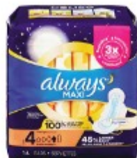
SANITARY PADS OVERNIGHT SIZE 4 / 16 CT