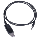
Programming Cable Midland Model: MPC400 MSRP: $19.99