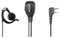
Over the Ear Headset Midland Model: MA1 MSRP: $29.99