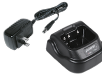
Desktop Charger with AC Adapter Midland Model: MDC400 MSRP: $29.99