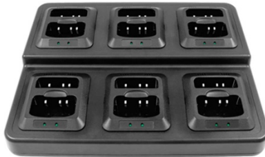
Multi-Unit Charger Midland Model: MGC400 MSRP: $249.99