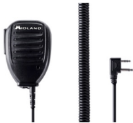
Speaker Mic Midland Model: MA3 MSRP: $39.99