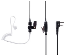
Concealed Headset Midland Model: MA2 MSRP: $39.99