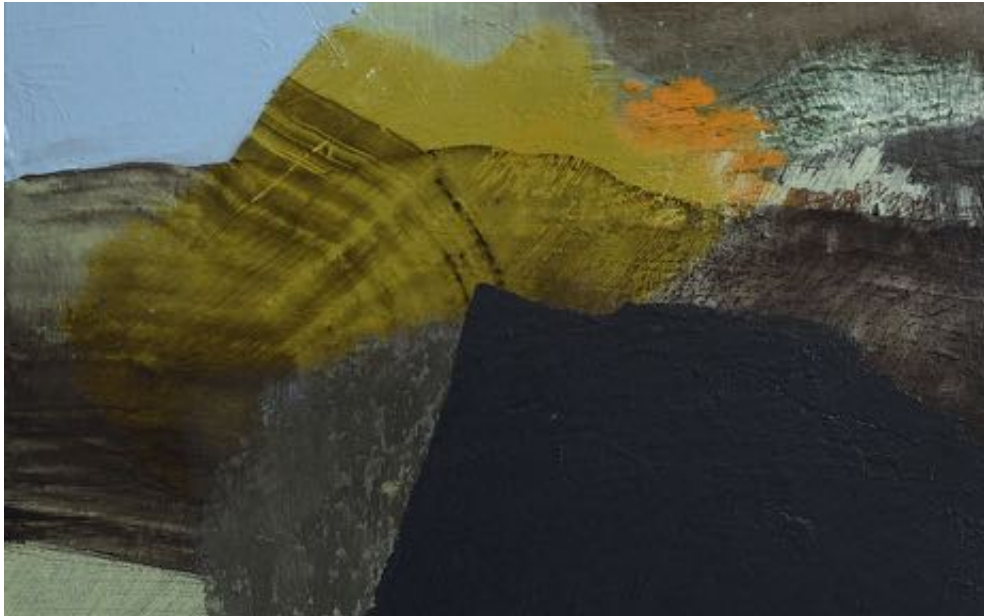
Woodland , Mixed Media on canvas board, 42x54cm (framed size) £975