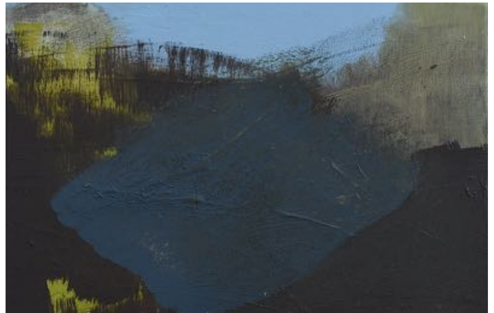
Spring Glade , Mixed Media on canvas, 33x43cm (framed size) £875