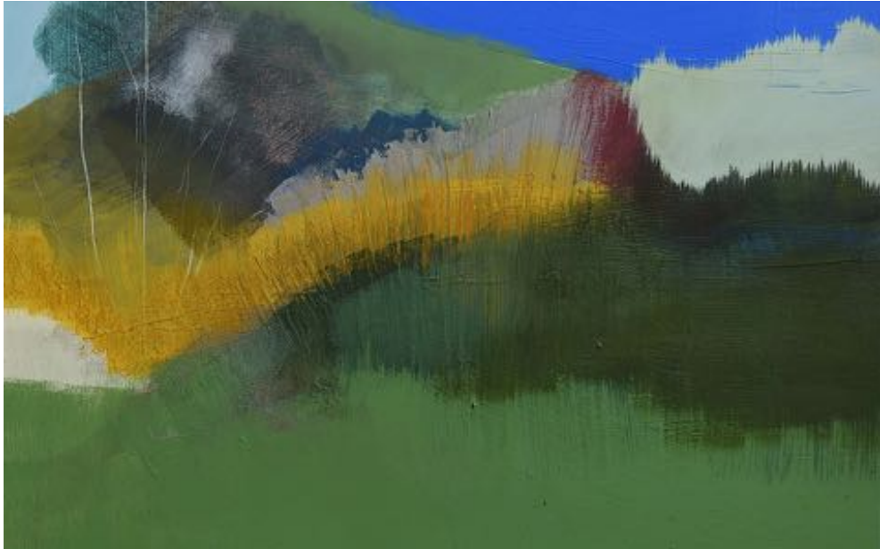
Bloom , Mixed Media on canvas, 64x80cm (framed size) £1,600