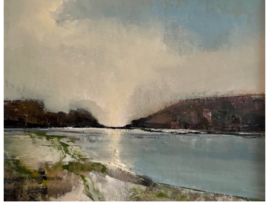
L to R: Mist Over Rame Pathway Rame at Sundown