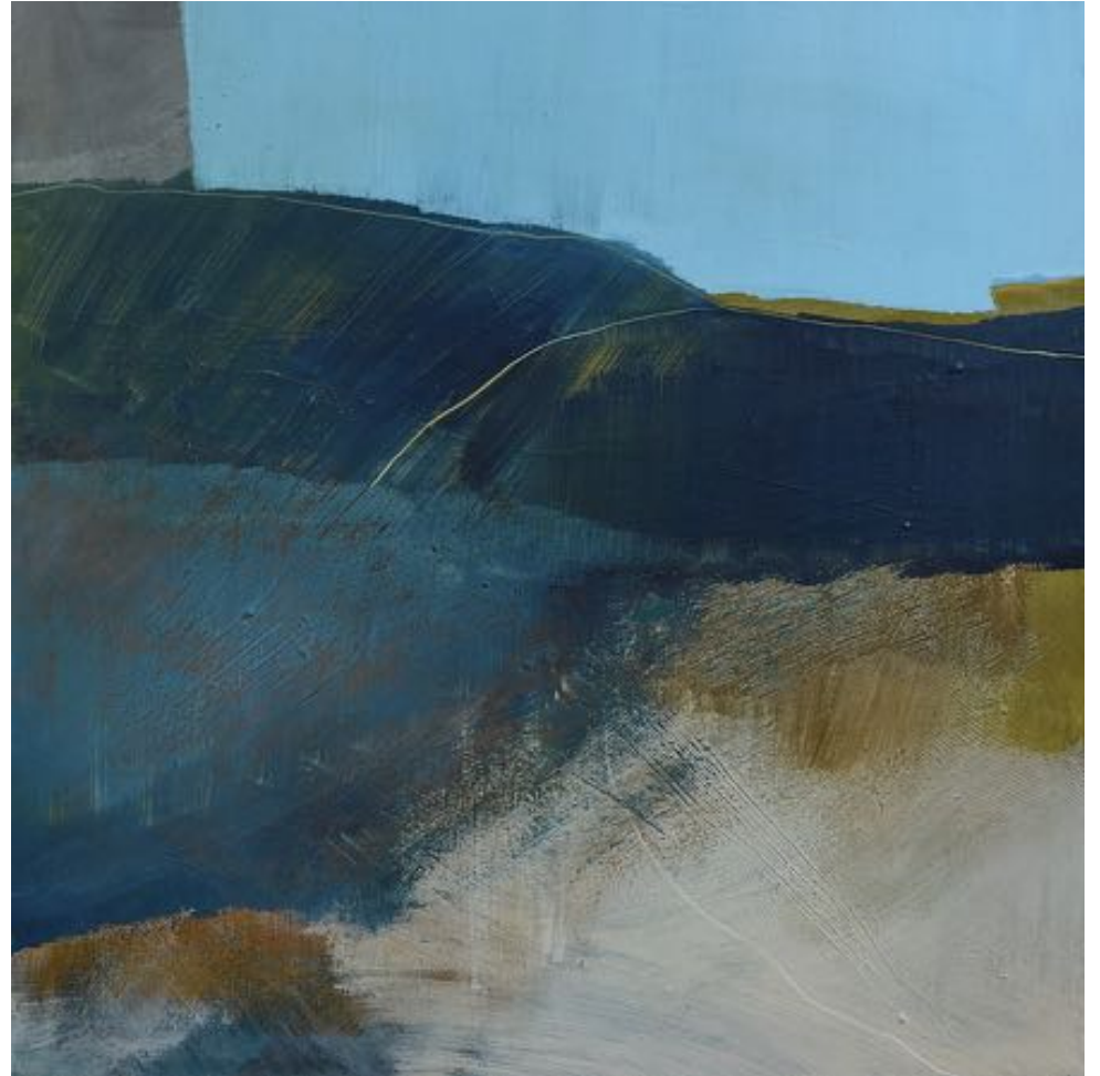
Opalescent , 80x80cm, £2,300