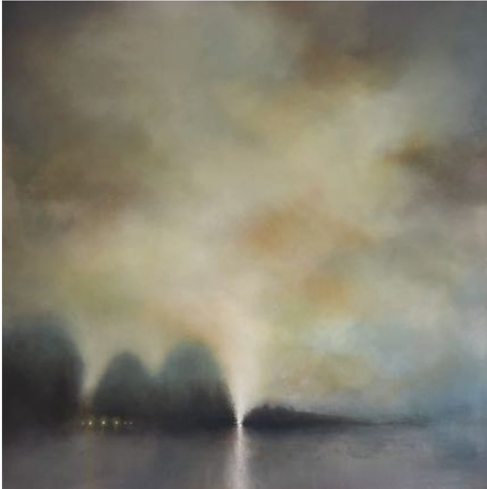
Brand New Day, oil on Canvas Linen, 100x100 cm, £2,200