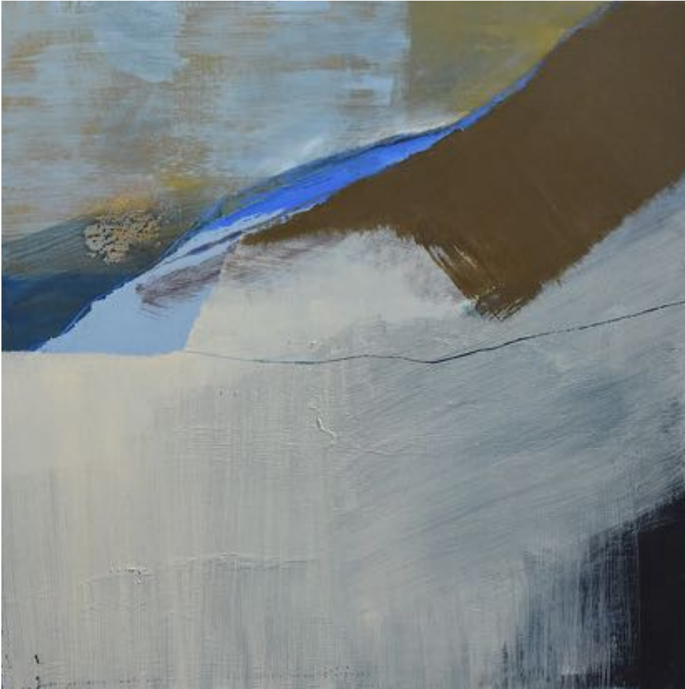
Transcience , 80x80cm, £2,300