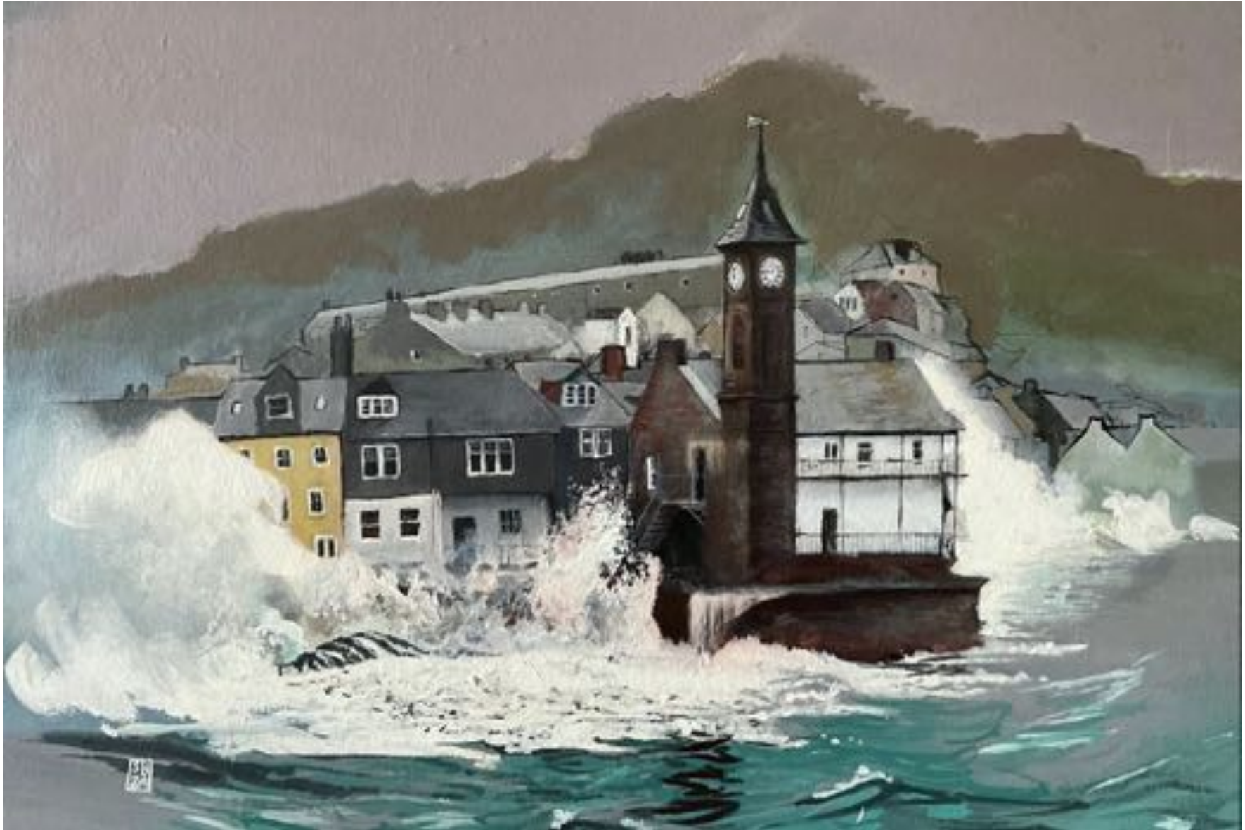
Kingsand , mixed media on canvas board, 42x60cm £795