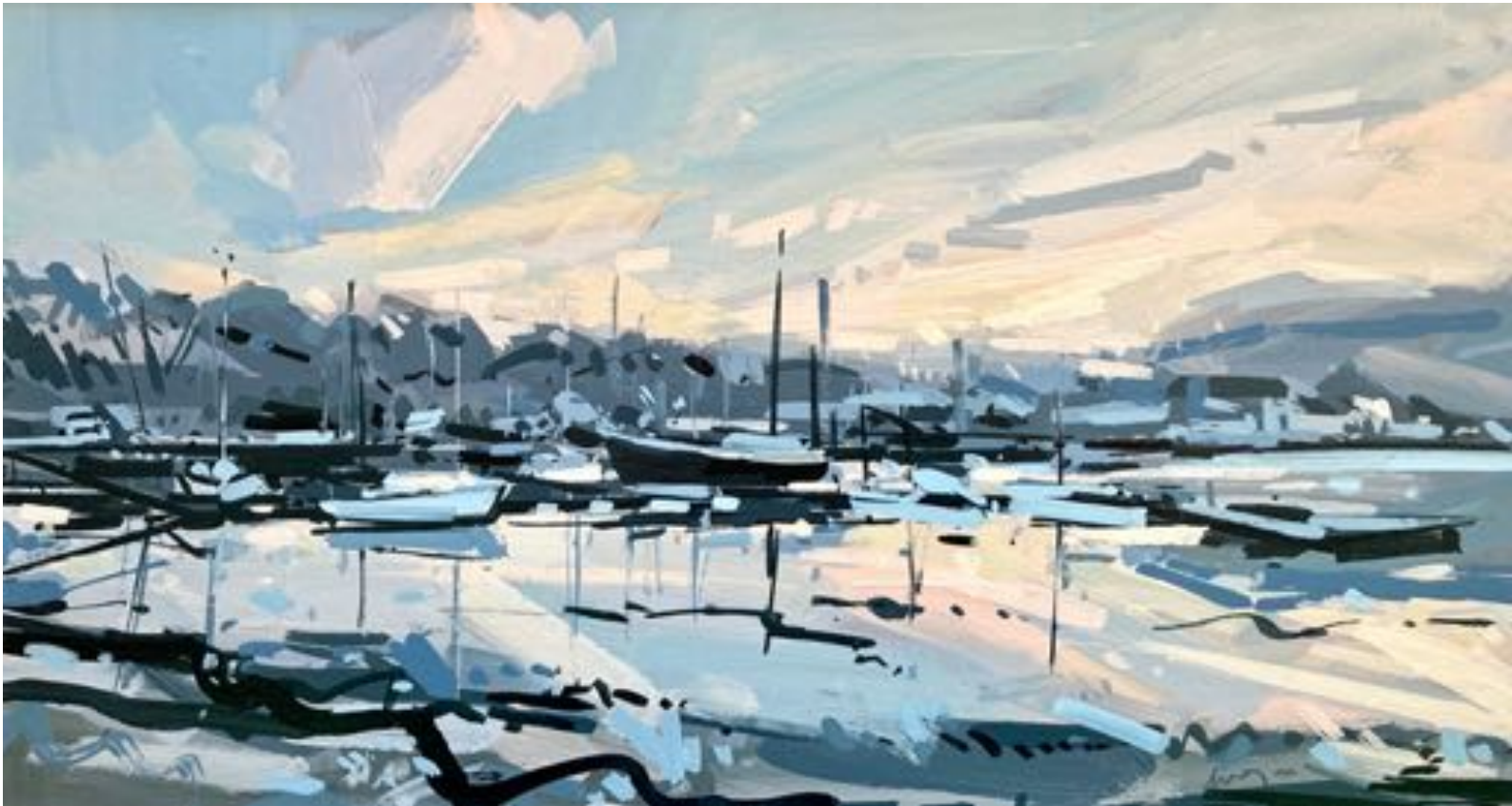
Millbrook Millpond, 18x33cm, £525 acrylic on board, mounted and framed with glass