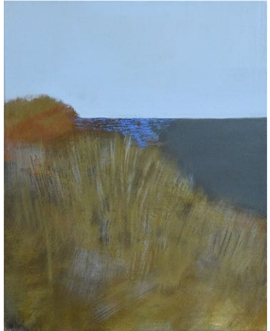
Looking South , 54x43cm, £995 mixed media on canvas board