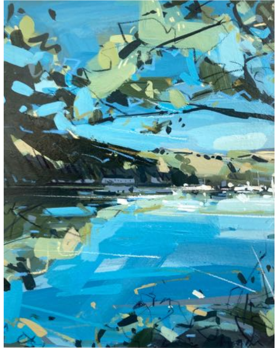
Over the Way , 23x18cm, £425 acrylic on board framed with glass