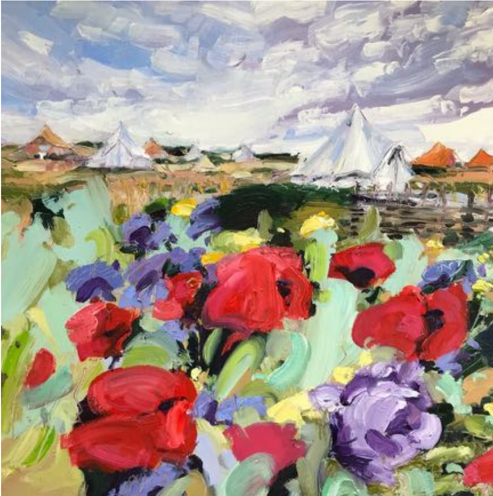
Halcyon Days , 30x30cm, £395