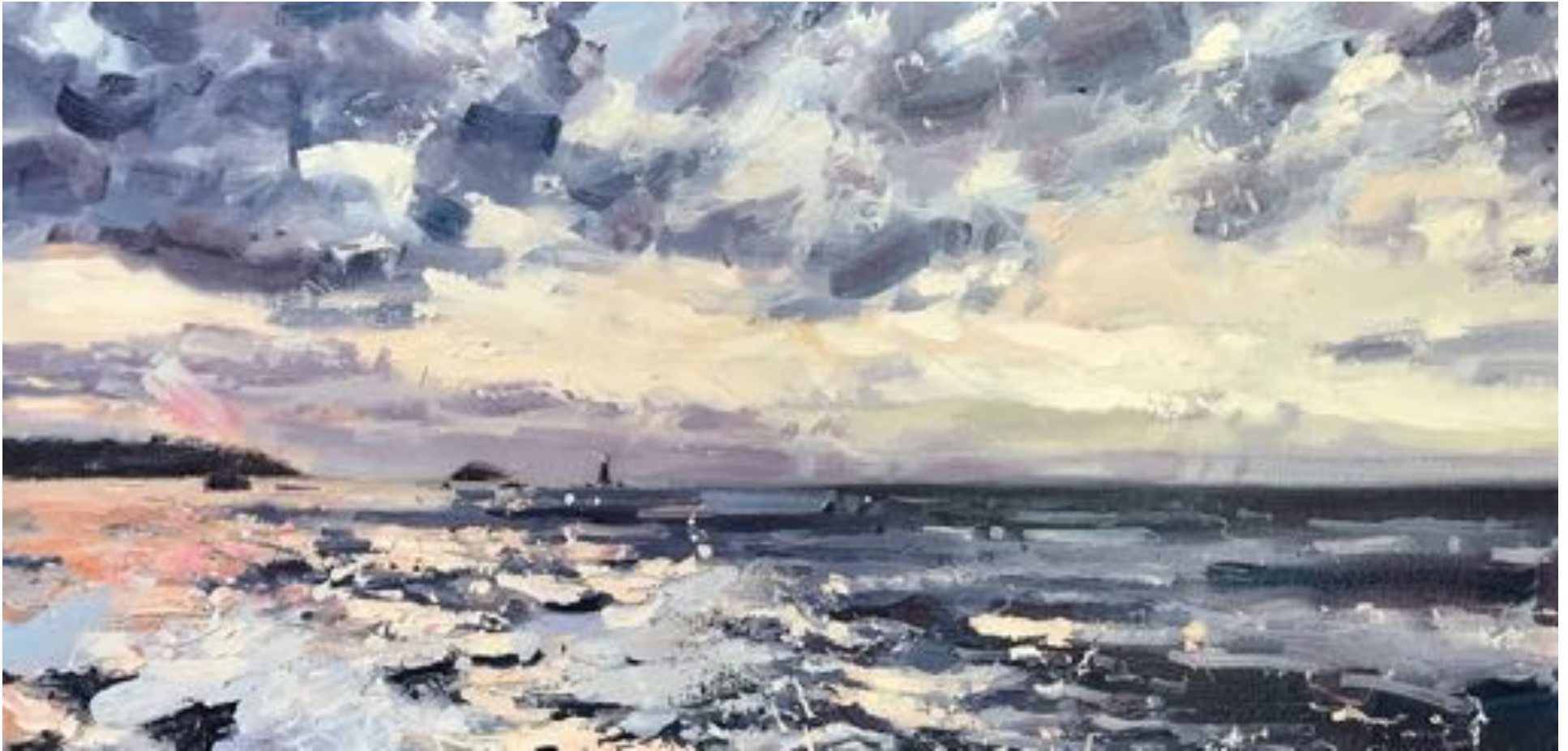
The View , 30x60cm, £595