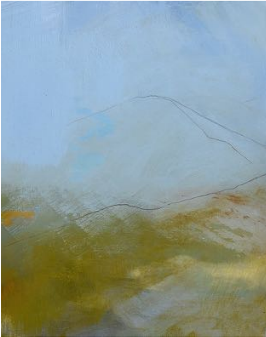
Towards Rame Head , 63x53cm, £1,100 mixed media on canvas board