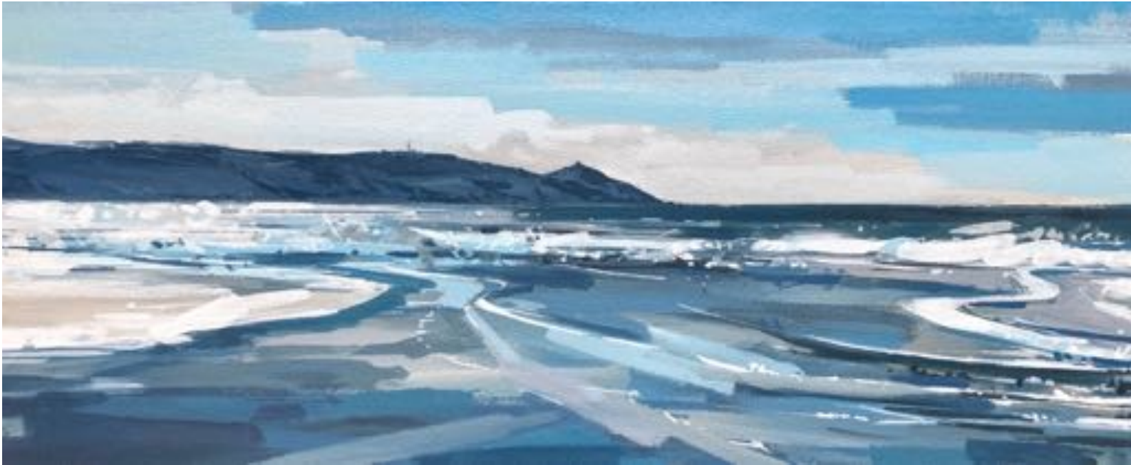
Long Lines, 25x60cm, £585