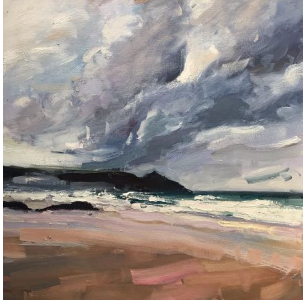
Weather Watching , 50x50cm, £755