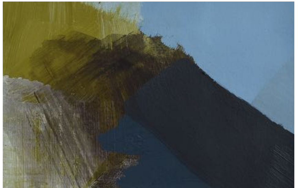
River's Edge , Mixed Media on papers, 23x30cm (framed size) £395