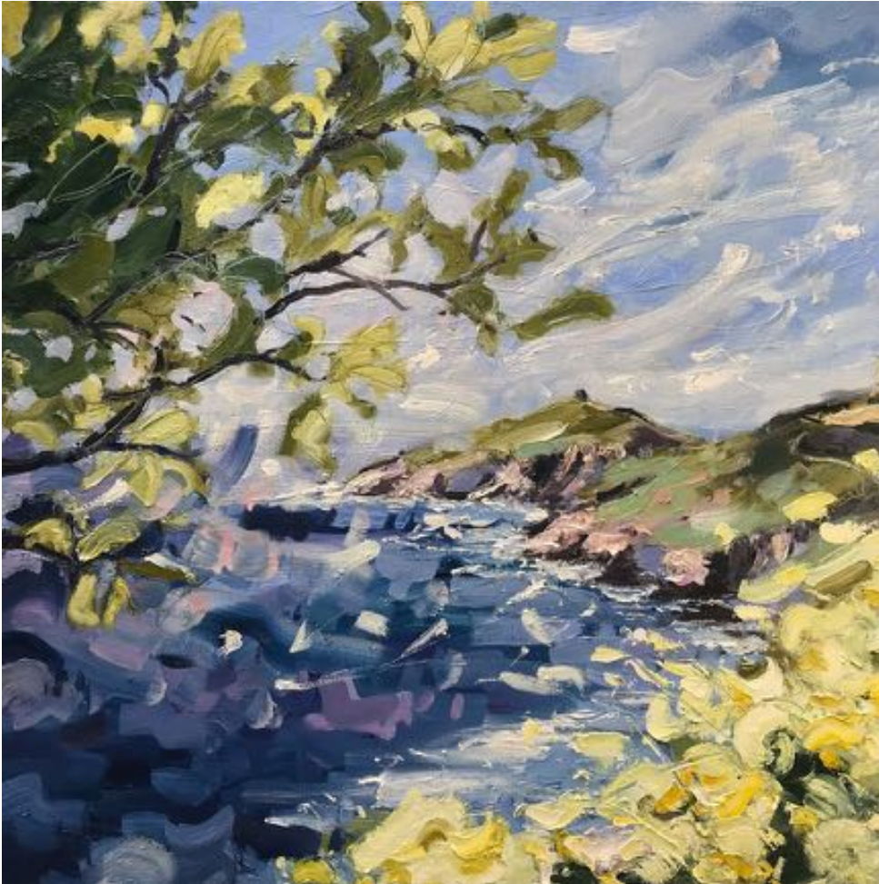
Glorious Sunshine , 50x50cm, £755