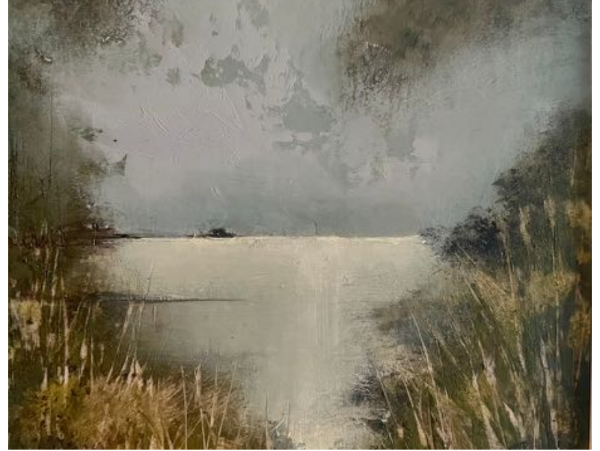
L to R: Beach Walk Breakwater Day Break