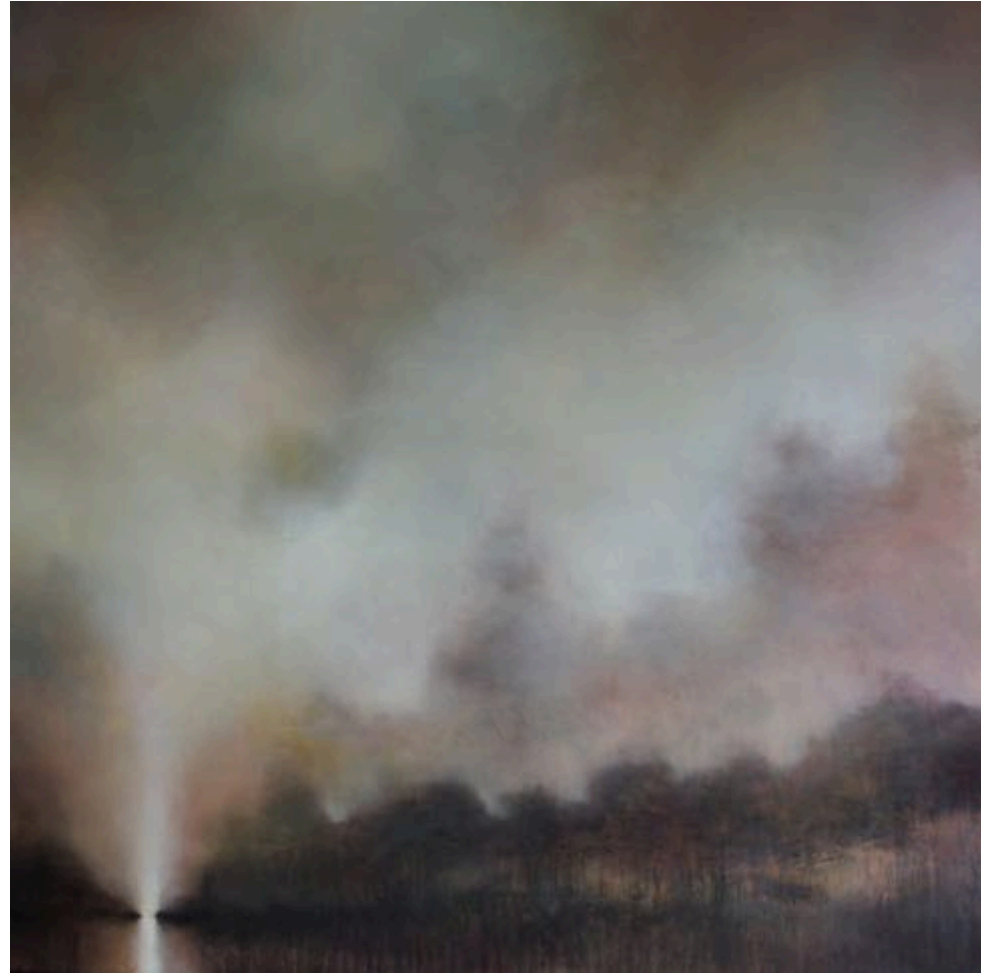
Velvet Vista, oil on Canvas Linen, 100x100 cm, £2,200