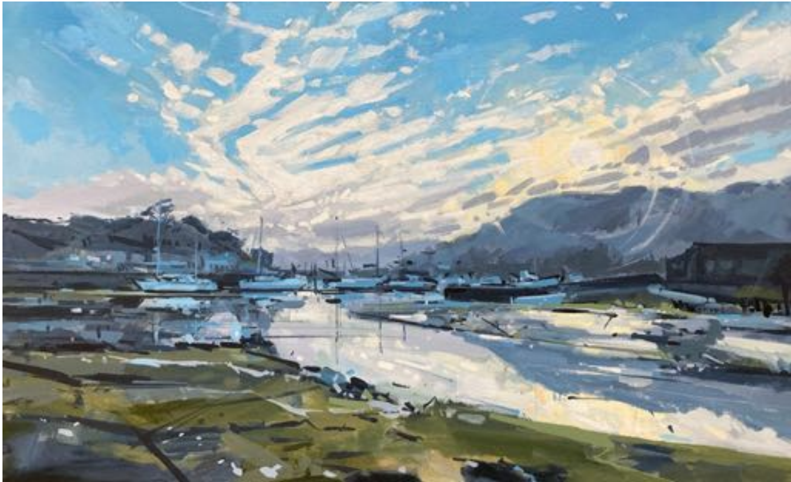
Alongside , 40x65cm, £895