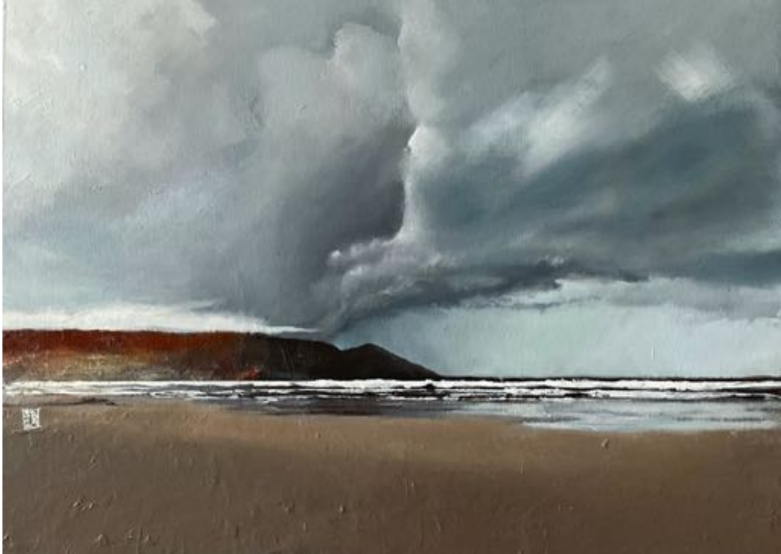
Rame Head , mixed media on canvas board, 53.5x67.5cm (framed size) £675