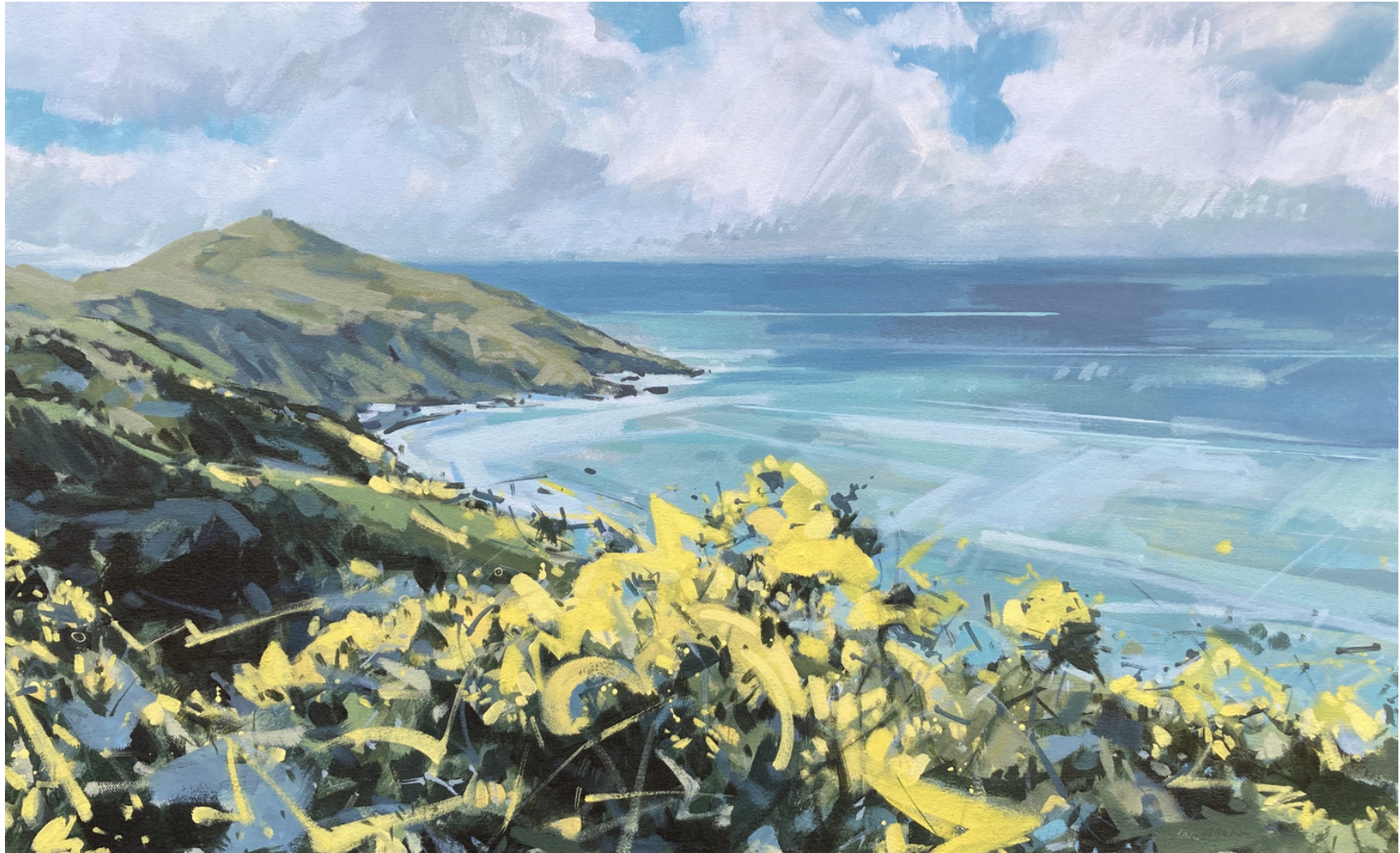
Thanks you Sunshine , acrylic on canvas, 40x65cm £725