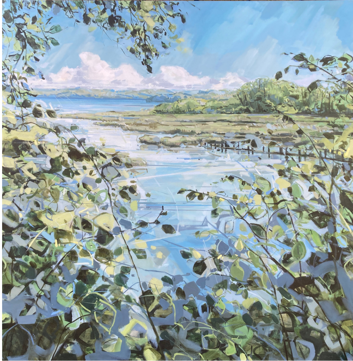
Past Reminders , acrylic on canvas, 100x100cm £2,200