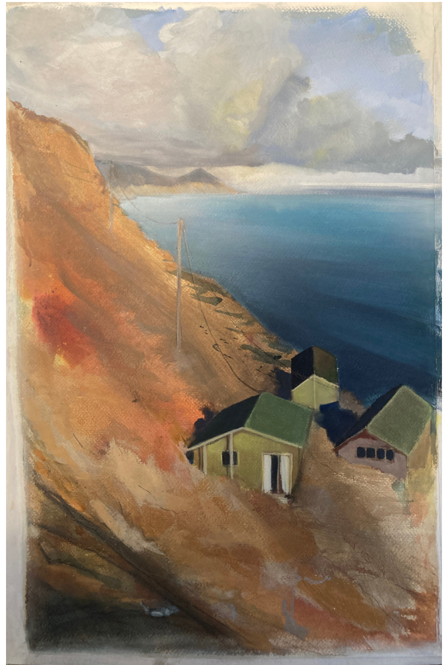
And Nothing Passes , acrylic and inks on paper framed size: 66x51cm £695