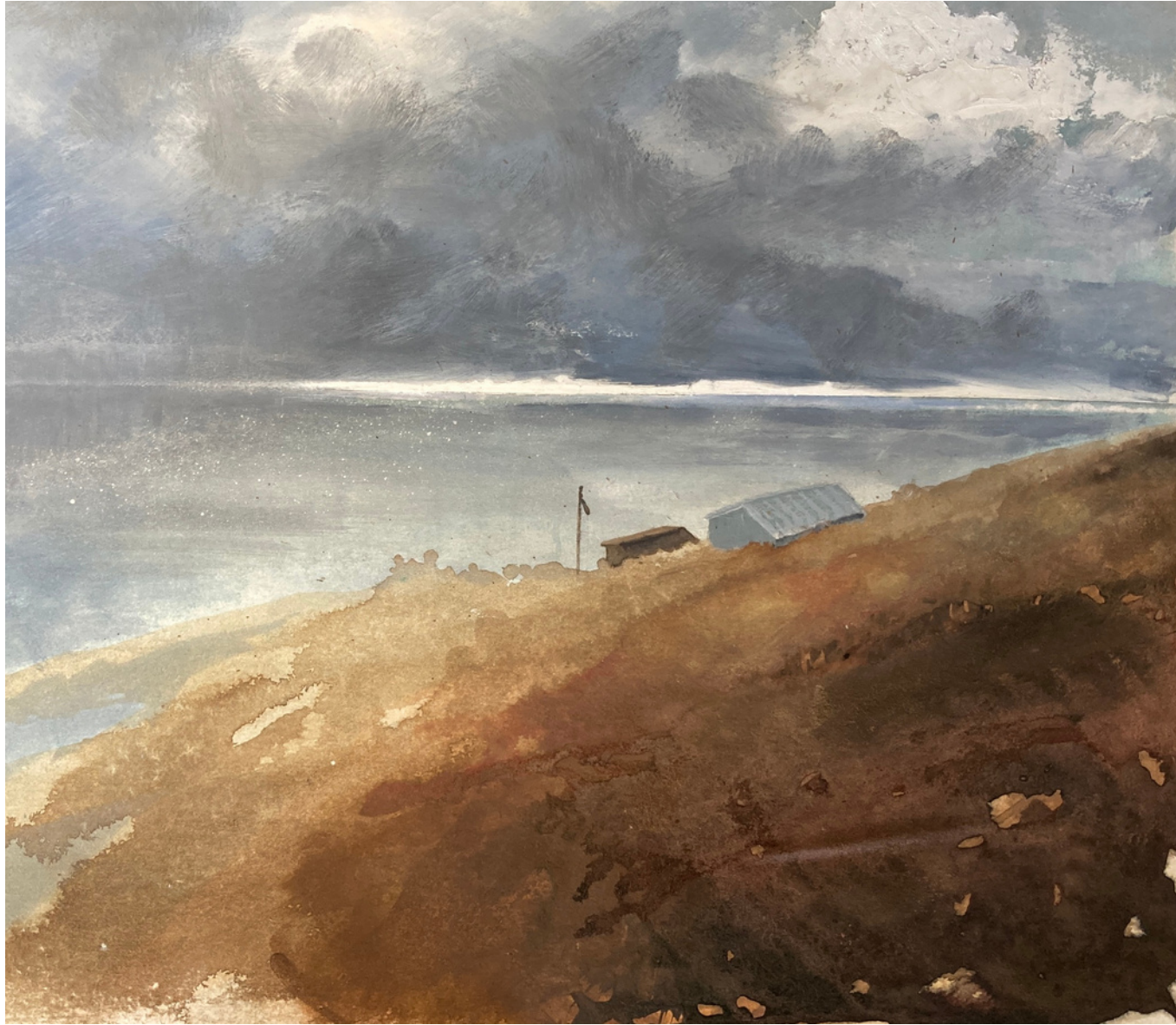
Perhaps, Even Longer , acrylic and inks on paper framed size: 52x68cm £695