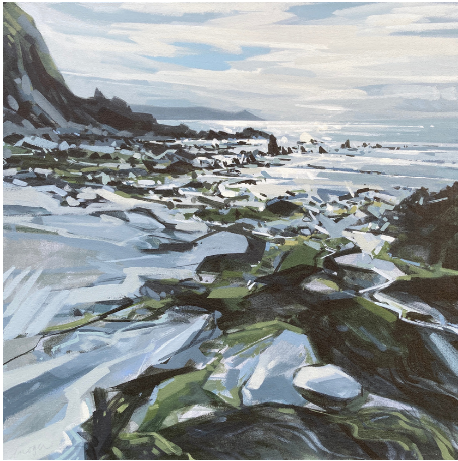
Shark Tooth Rocks at Finnygook, acrylic on canvas, 50x50cm £725