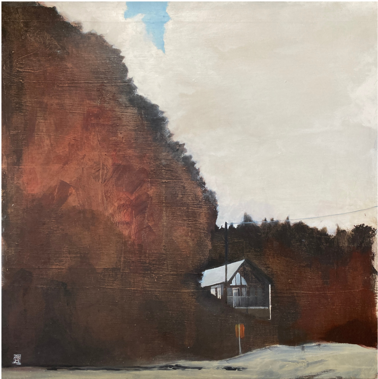
Never See the Difference , mixed media on canvas framed size: 84x84cm £1,495