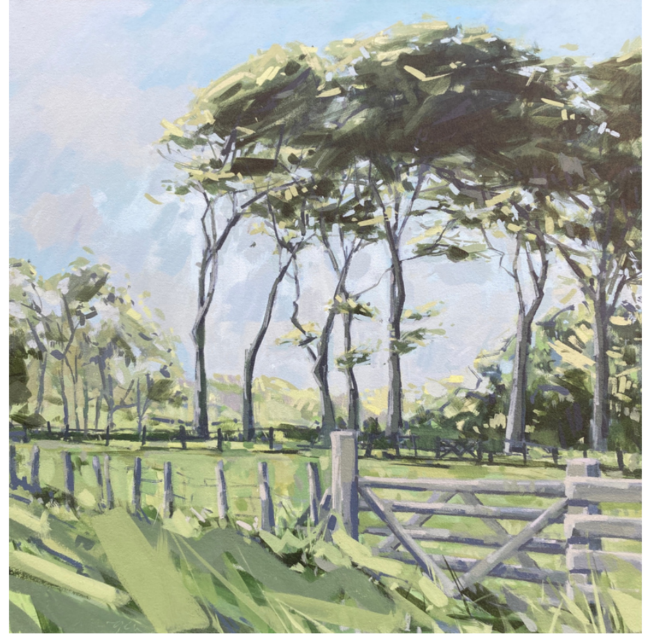
Our Lady of the Tall Trees , acrylic on canvas, 50x50cm £725