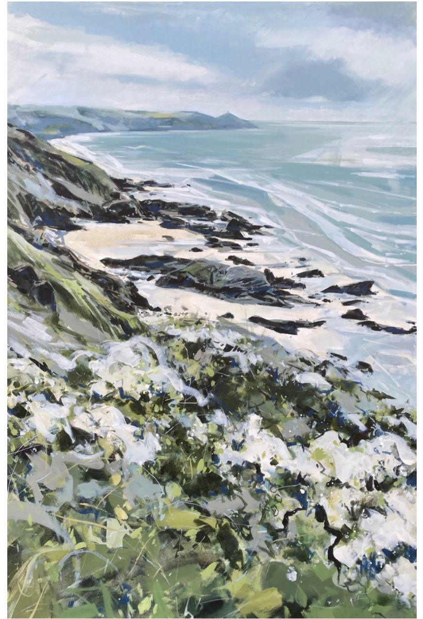
Falling Away Acrylic on canvas, 90x60cm £1,450