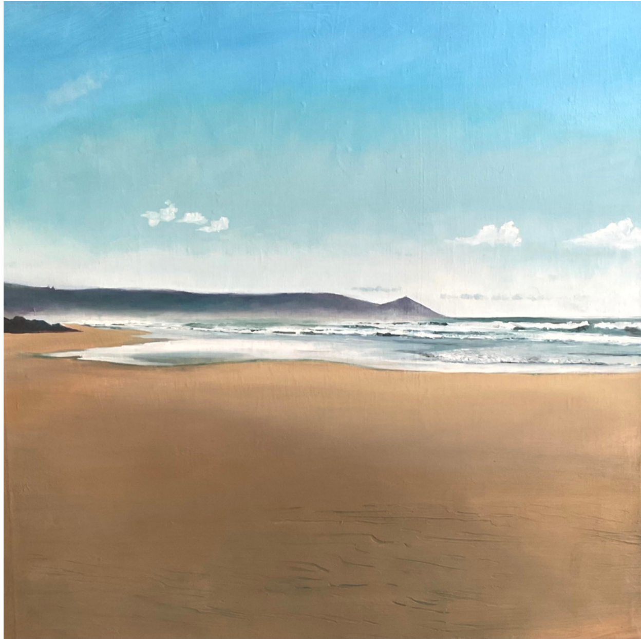
'Lines i , mixed media on canvas framed size: 84x84cm £1,495