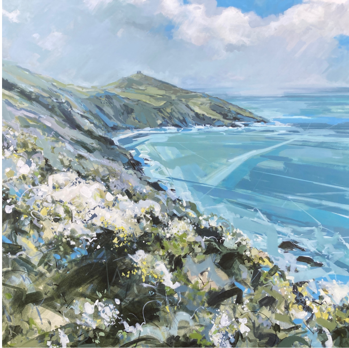
Mist, Lift, Sun, Shift , acrylic on canvas, 100x100cm £2,200