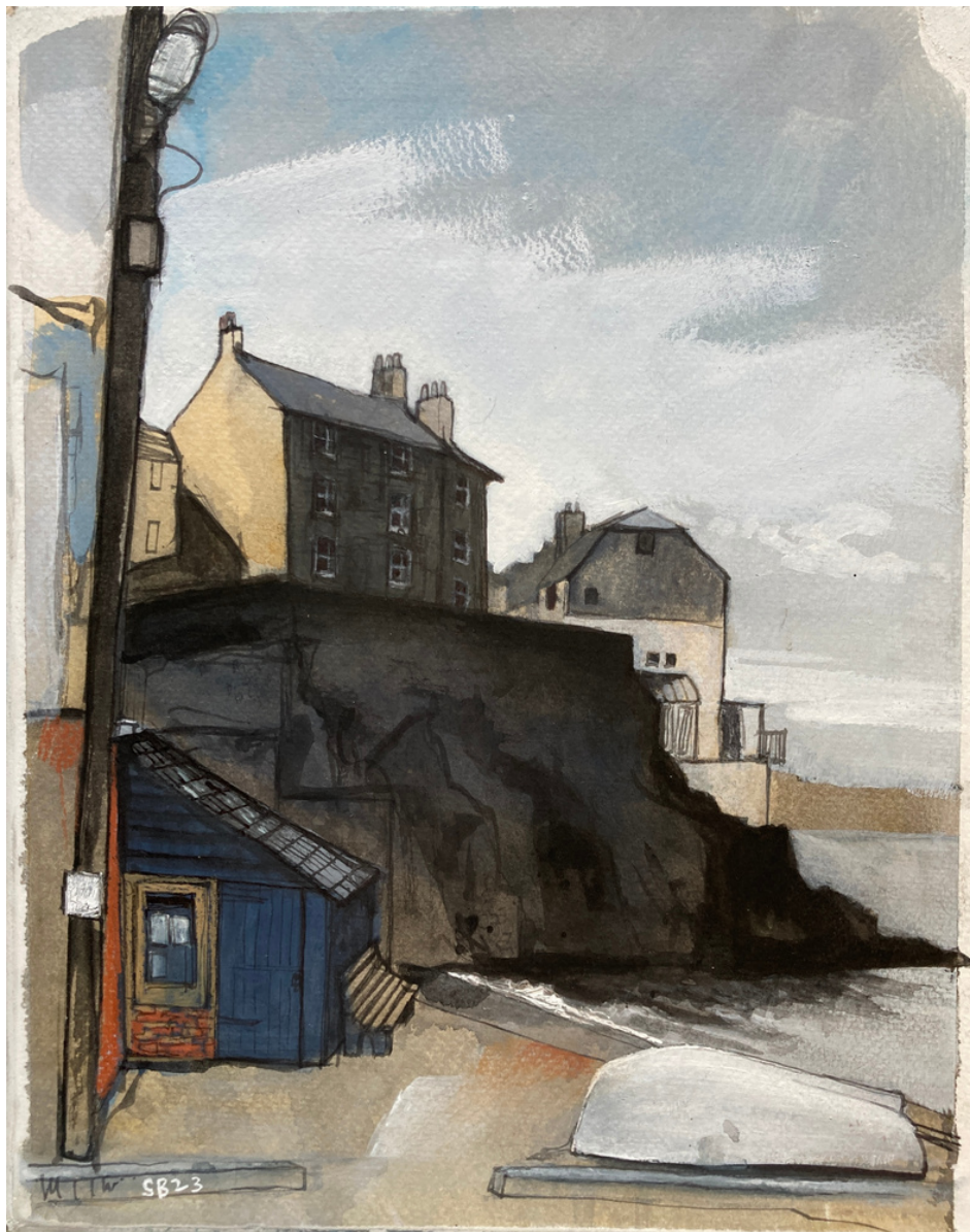
Cawsand , acrylic and inks on paper framed size: 34x29cm £195