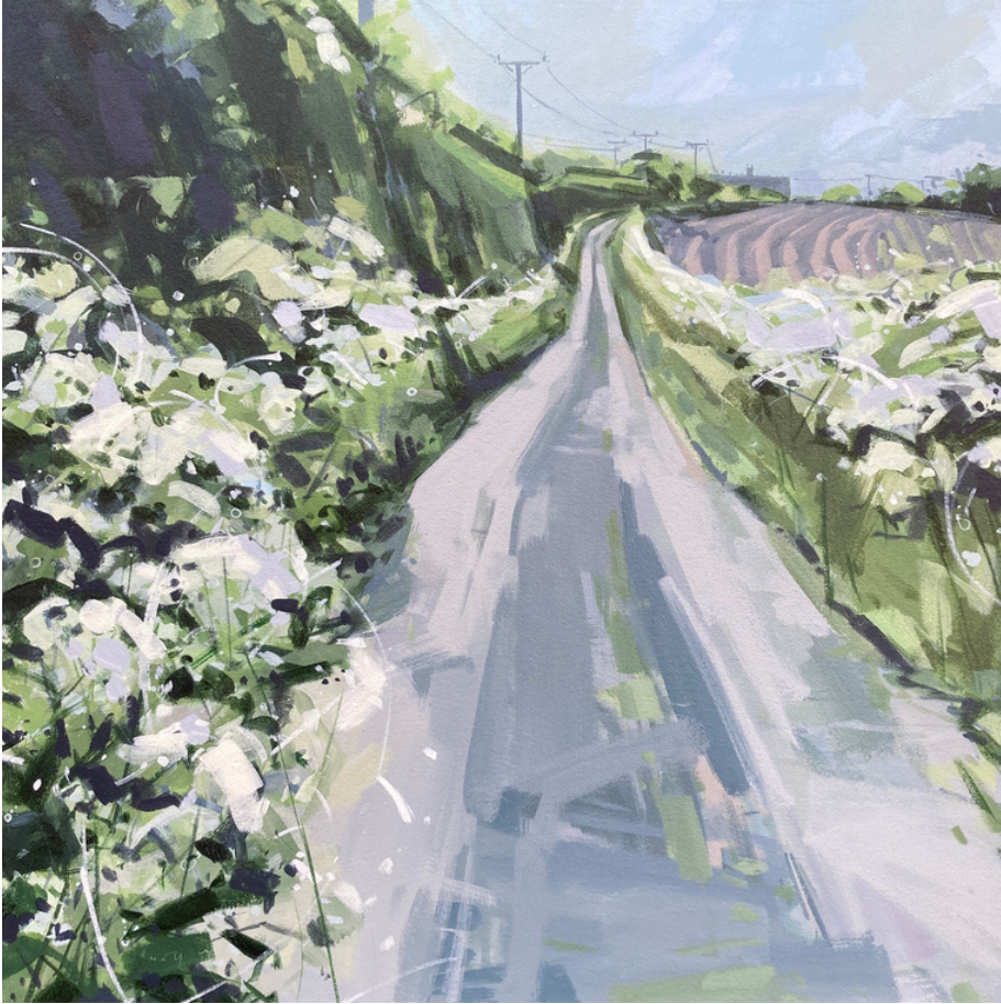
Return Road , acrylic on canvas, 50x50cm £725