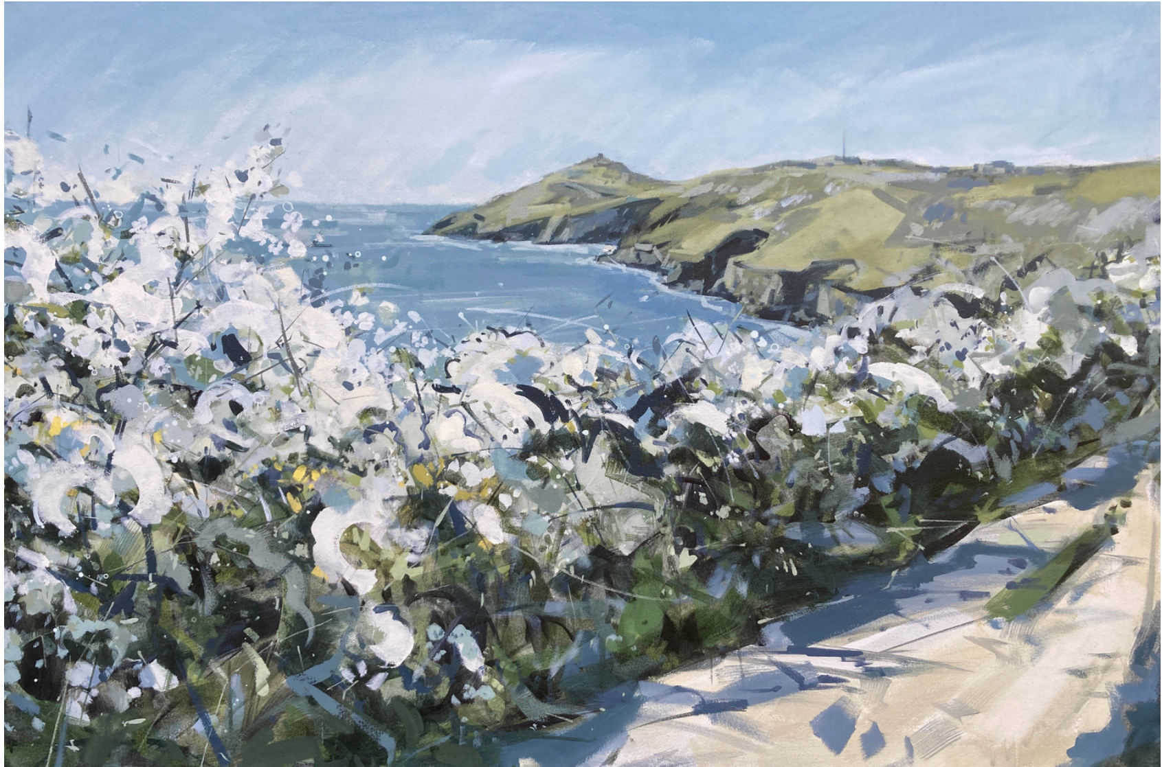
Blossom Snowfall, Bluebird Day , acrylic on canvas, 60x90cm £1,450