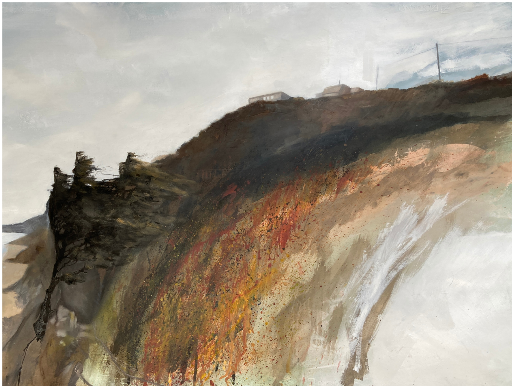
And Nothing Passes , acrylic and inks on paper framed size: 70x100cm £1,350