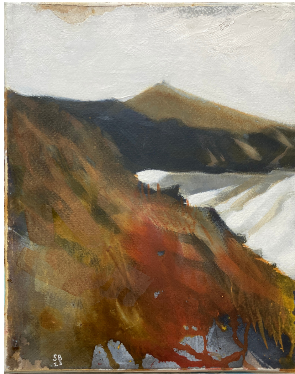
Headland , acrylic and inks on paper framed size: 34x29cm £195