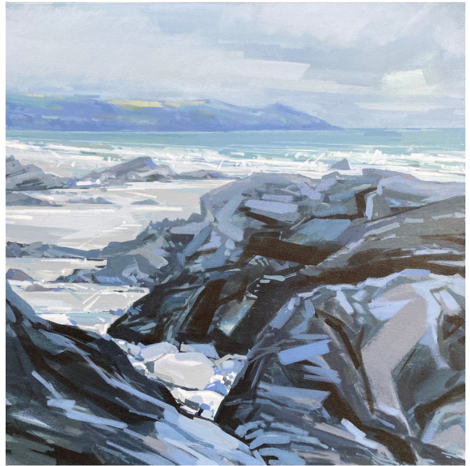
All the Triangles, acrylic on canvas, 50x50cm £725