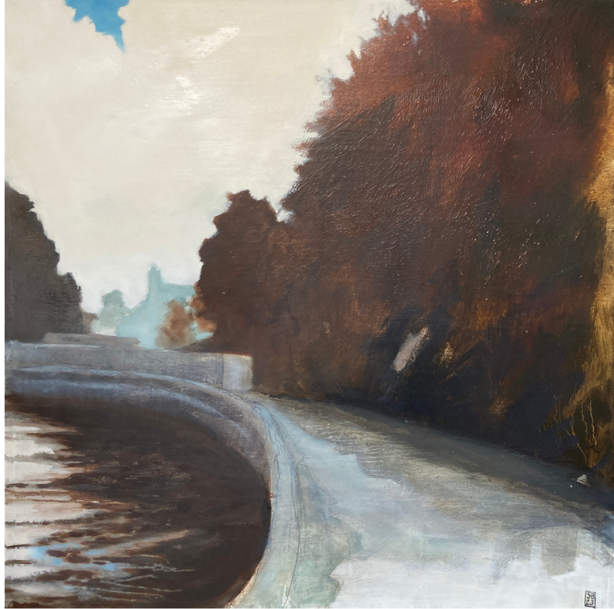
As It Ever Does , mixed media on canvas framed size: 84x84cm £1,495