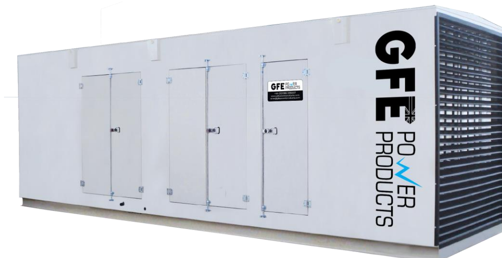
Available as an open set: GFE1375PLO