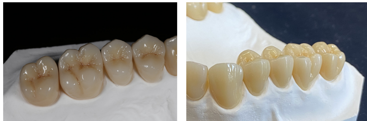
Zirtooth UltraLuster A1 - Shade A2(15), A3(16), A3.5(17) * after color characterization