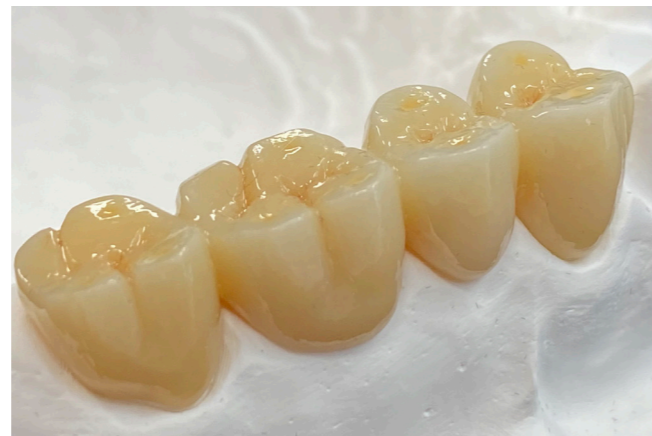
Zirtooth MultiLuster A2 - Shade A2(24-25), A3(26), A3.5(27) * after color characterization