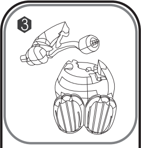
Insert the marshmallow stick into the hand prior to installing the arm to the body.