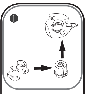
Enclosed are 2 small spiral caps. Before starting assembly combine and insert into bottom.