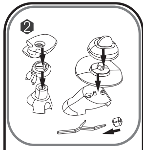
Some pieces have a positioning mark to assemble with other pieces.