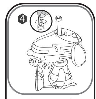
Use the center pole to lock up all pieces tightly with the key included.