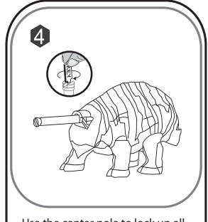
Use the center pole to lock up all pieces tightly with the key enclosed.