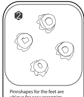
ubique for easy recognize.