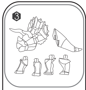
Suggest to build up the head, legs and tail in advance, much convenient to insert to the body.