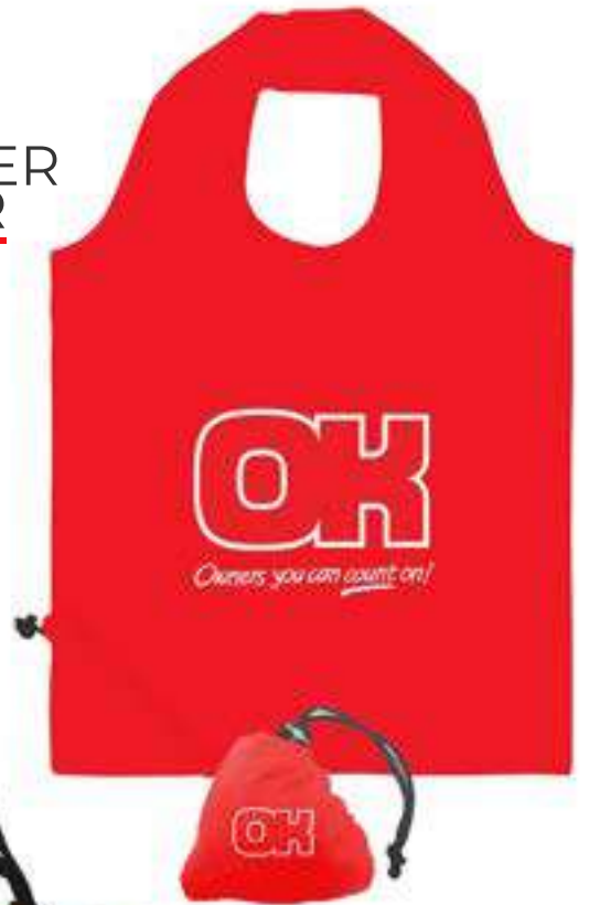
FSH01 FOLDABLE SHOPPER