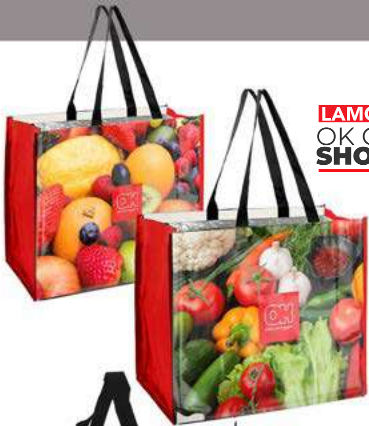
LAMCO-V OK COOLER SHOPPER