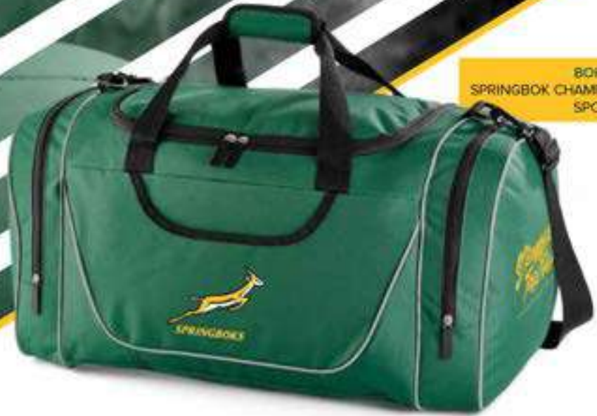
BOK-175-DG1 SPRINGBOK CHAMPIONSHIP SPORTS BAG