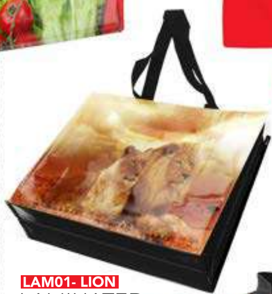
LAM01-LION LAMINATED SHOPPER