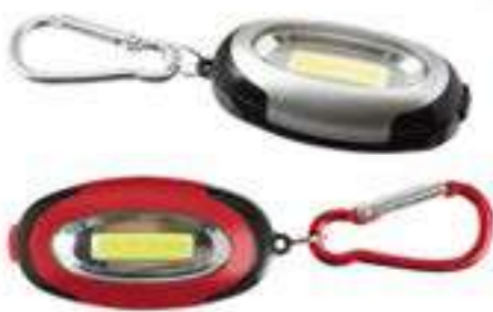
BK7280 Carabiner Light with 6 COB LEDs - RED/BLACK