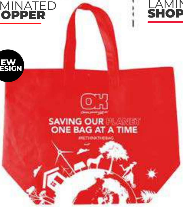
SHOP38 ULTRASONIC SHOPPER