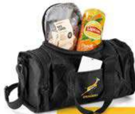
BOK-166-BL SPRINGBOK ERINDALE 6-CAN COOLER