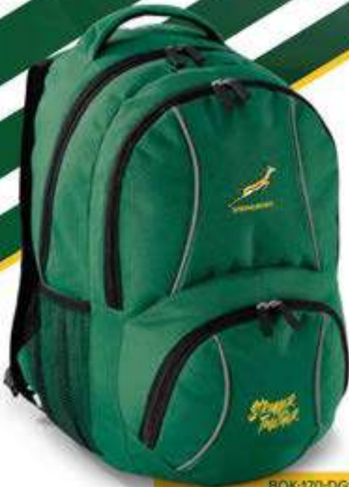
BOK-170-DG1 SPRINGBOK CHAMPIONSHIP BACKPACK