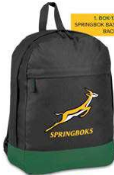
1. BOK-131-DG1 SPRINGBOK BASELINE BACKPACK