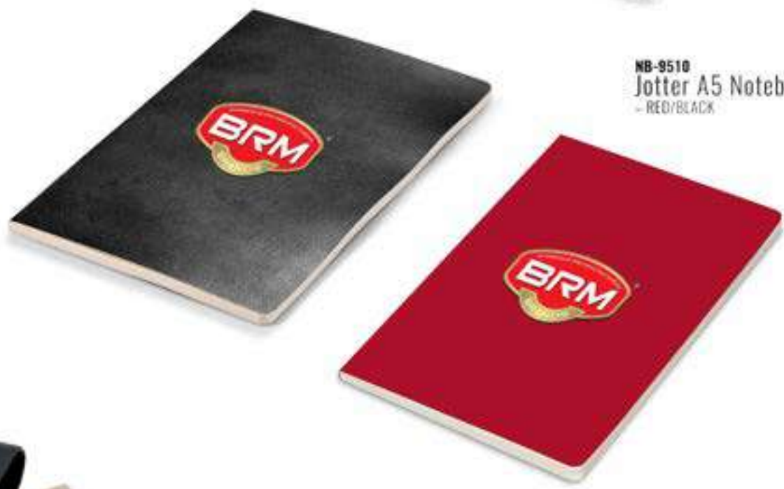
NB-9510 Jotter A5 Notebook - RED/BLACK