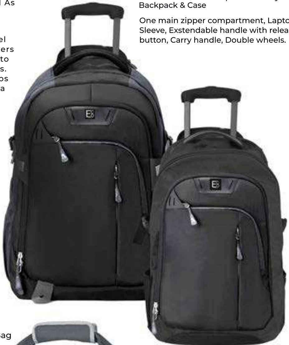
LBT01# Two Piece Corporate Trolley Backpack & Case

One main zipper compartment, Laptop Sleeve, Extensible handle with release button, Carry handle, Double wheels.