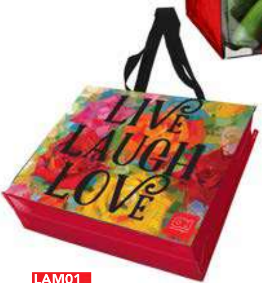
LAM01 LAMINATED SHOPPER