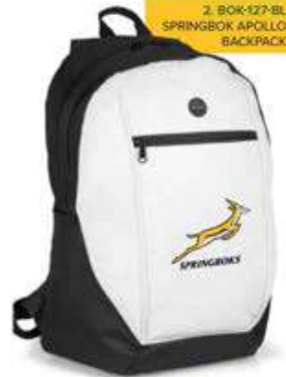
2. BOK-127-BL SPRINGBOK APOLLO BACKPACK