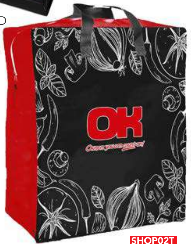
SHOP02T OK TAXI BAG