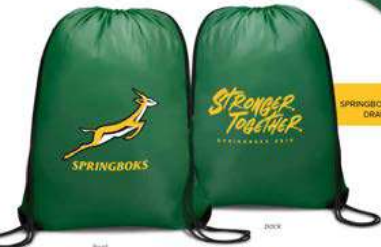
BOK-173-DG1 SPRINGBOK SYMPHONY DRAWSTRING BAG