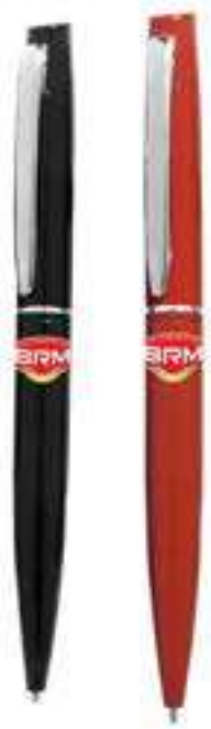
PEN-1200 Regatta Mix & Match Ball Pen - RED/BLACK