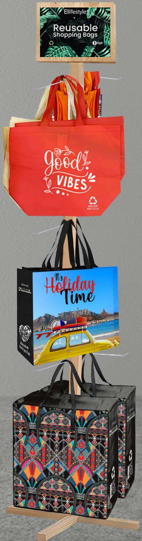
Everyday Reusable Shopper Bag Hanging Display