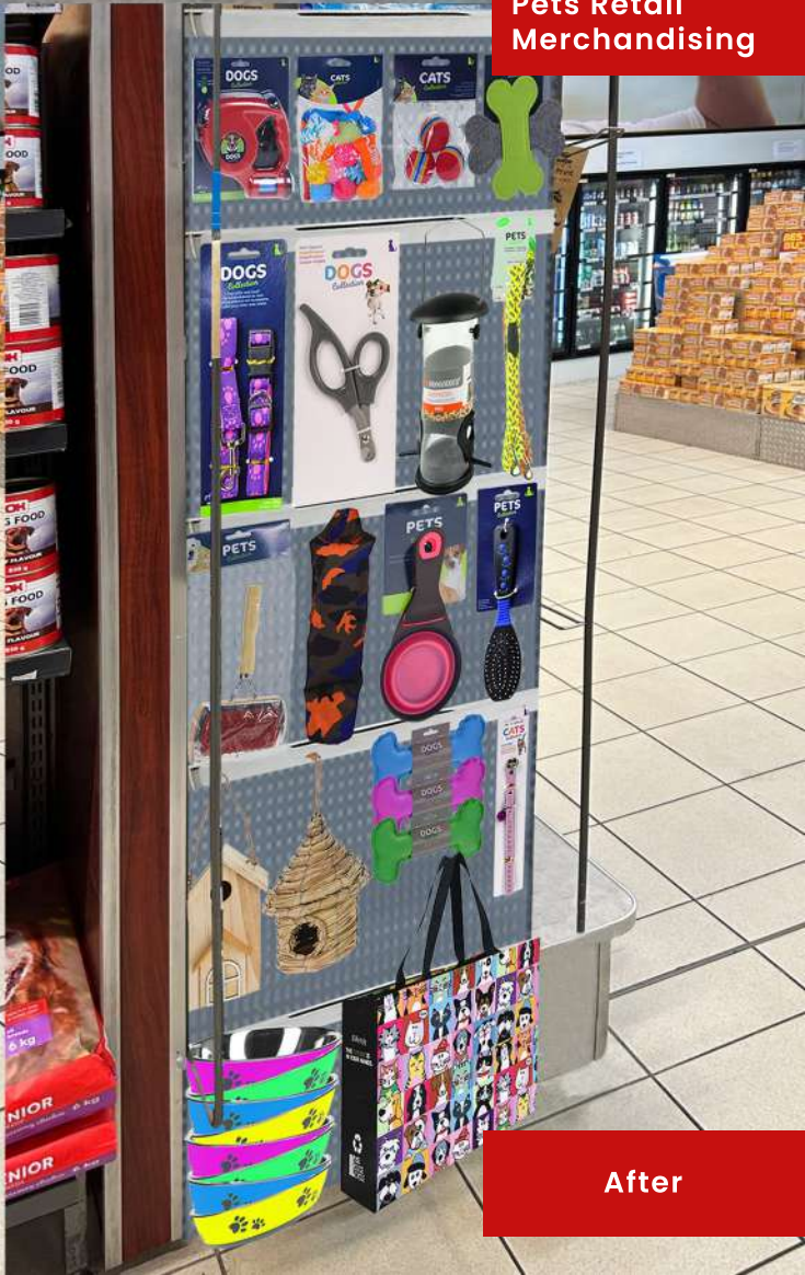
Pets Retail Merchandising