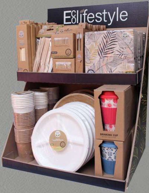
Eco-Friendly Long Display