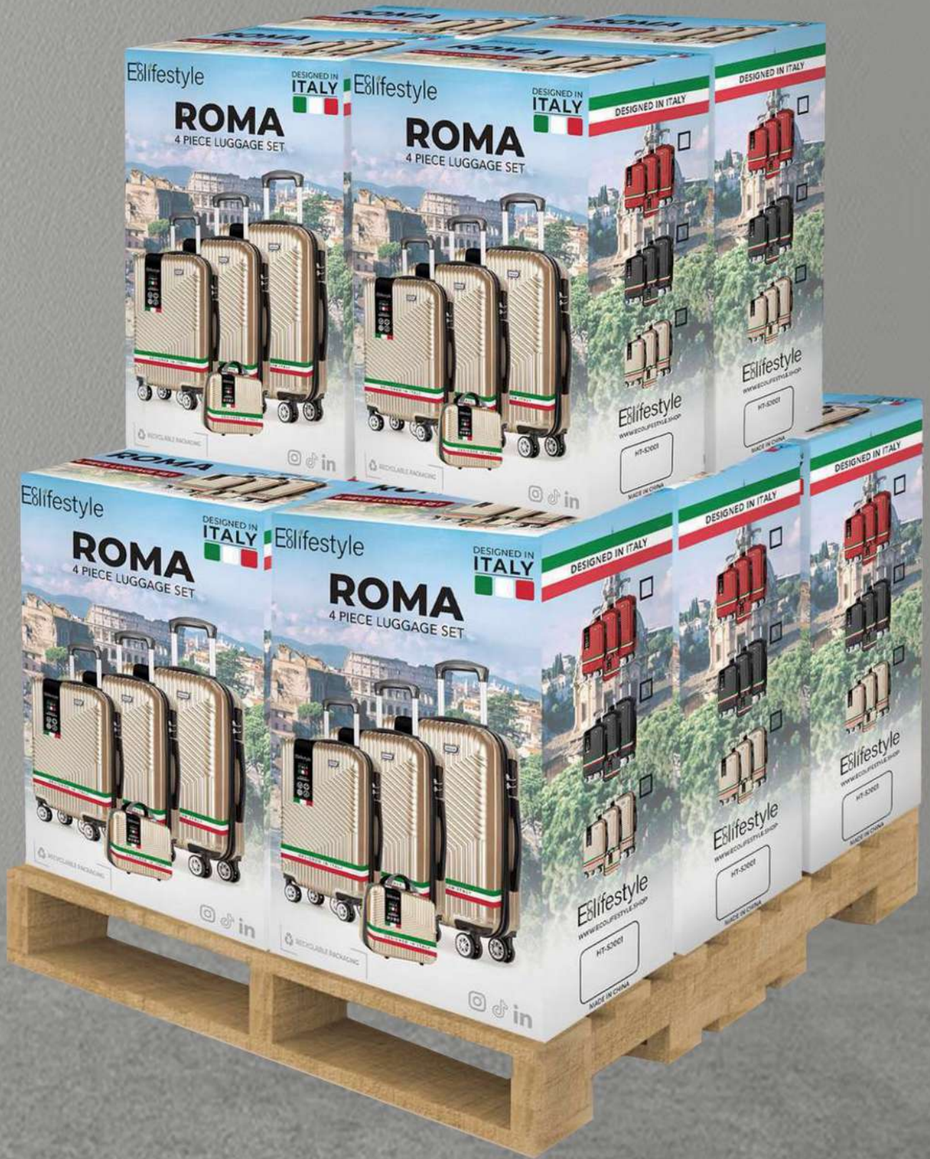
Fast Retail Selling Luggage Display