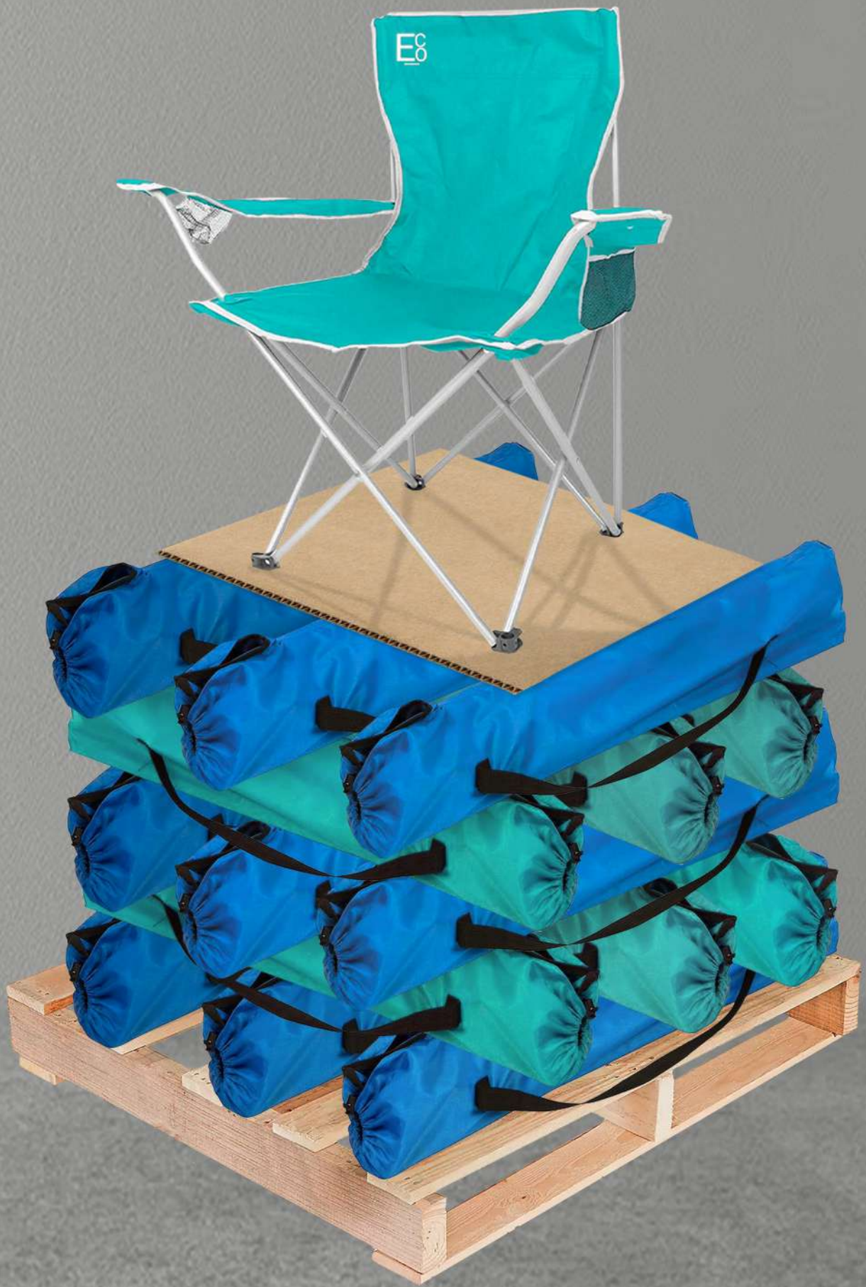
Fast Retail Chair Merchandising Display