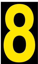
5000 Series 44x72mm

Suitable for low temperature applications. B-997 BradyLite® has a cold temperature adhesive. This engineering grade reflective sheeting can be applied at temperatures as low as -27°C making this an ideal material for cold weather use.