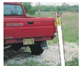
Tough Polycarbonate Posts have a pointed end for ground fixing. Highly visible legends get your message across.