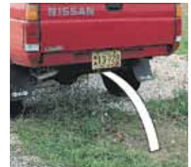
Bounce-Back Posts are durable and flexible. If driven over they simply "Bounce Back" into position.