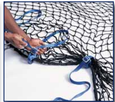
Netting Easily Adjusts to Suit any workspace