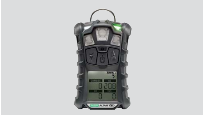
ALTAIR 4X MSHA Multigas Detector