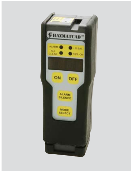
HAZMATCAD® and HAZMATCAD Plus Chemical Agent Detectors

Detect both chemical warfare agents and selected toxic industrial chemicals (TICs). Ruggedly constructed, compact and lightweight, each detector is designed for ease of use and requires no prior training.