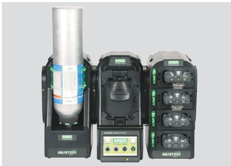
GALAXY® GX2 Automated Test System

This easy-to-use automated test stand offers high performance as either a stand-alone unit or an integrated portable detector management system.