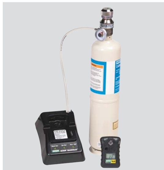
ALTAIR QuickCheck® Station

The ALTAIR QuickCheck Station tells a user which test is being administered and whether the detector passed or failed.