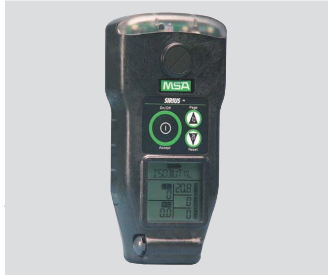
Sirius Multigas Detector