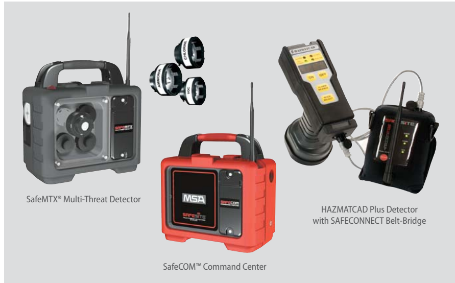
SAFESITE® Multi-Threat Detection System

These advanced detection systems provide critical information and data for rapid decision-making in the face of chemical, gas, radiation, and other hazard-inducing conditions.