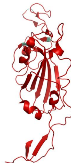
Structural model of the receptor binding domain (RBD) of the spike protein. The location of the mutated parts are highlighted in green.

The SARS-CoV-2 spike (S) protein is a large type I transmembrane protein composed of two subunits, S1 and S2. The S1 subunit contains a receptor-binding domain (RBD) responsible for binding to the host cell receptor angiotensin-converting enzyme 2 (ACE2). Several mutants of the spike protein are known, including a novel SARS-CoV-2 lineage AY.1/AY.2/AY.3. Compared to the previously circulating variants, the mutations L452R and T478K of the SARS-CoV-2 Spike S1 (RBD) may cause a stronger affinity of the spike protein to hACE2 and also conferring an increasing ability to evade the hosts' immune system. Furthermore, the Delta Plus variant has an additional K417N amino acid mutation. This mutation seems to have no significant impact on the clinical spectrum of disease and not more transmissible than Delta.