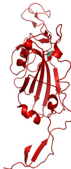
Structural model of the receptor binding domain (RBD) of the spike protein. The location of the mutated part is highlighted in green.

The SARS-CoV-2 spike (S) protein is a large type I transmembrane protein composed of two subunits, S1 and S2. The S1 subunit contains a receptor-binding domain (RBD) responsible for binding to the host cell receptor angiotensin-converting enzyme 2 (ACE2). Several mutants of the spike protein are known. The N439K mutation is known as the second most common mutation in the receptor binding domain and results in increased ACE2 affinity. This mutation seems to have no impact on the clinical spectrum of disease with slightly higher viral loads in vivo. However, the N439K mutants bind to the human ACE2 receptor with two-fold greater affinity and are may be resistant to some neutralising monoclonal antibodies that are used in treatments against COVID-19.