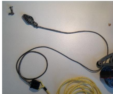
Step 5 – It should now look like this