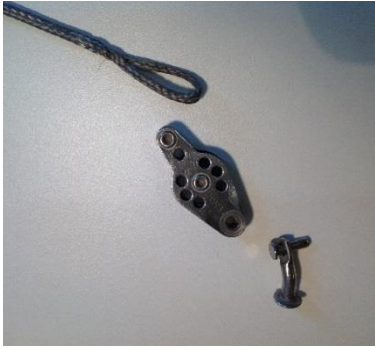
Step 1 – Remove the Top Block Pin/Bolt and Kicker Tang