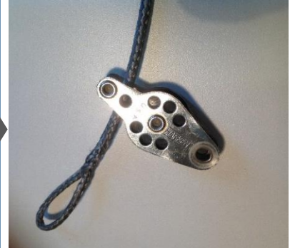
Step 3 – Thread the Primary Line Loop Through the Becket End