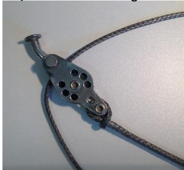
Step 7 – Refit the Top Block Pin/Bolt and Kicker Tang