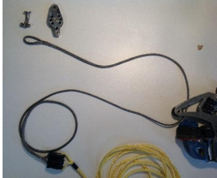
Step 2 – Pass The Primary Line through the Kicker from the bottom towards the top