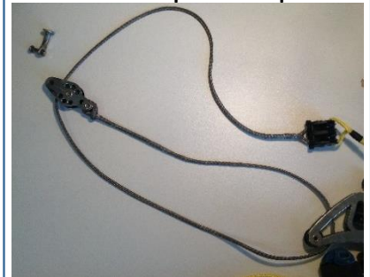
Step 6 – Pass the Kicker Primary Line over the top of the Top Block