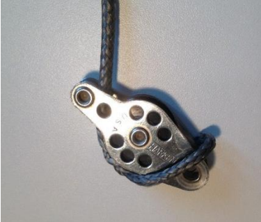
Step 4 – Push the Block all the way through the Primary Line Loop