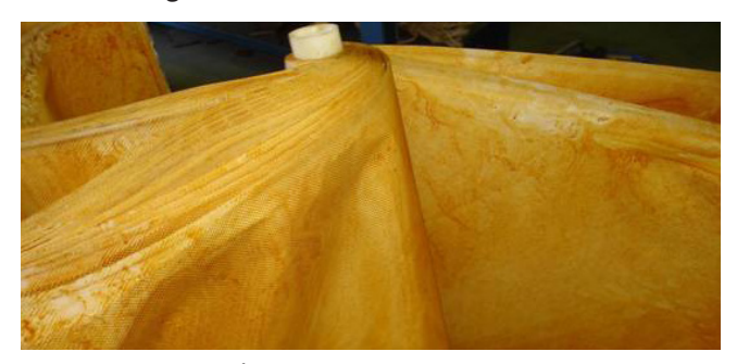
Removes Iron Deposits